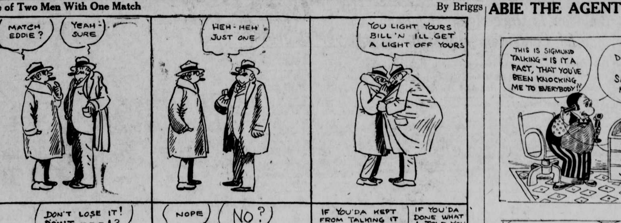
Movie of Two Men With One Match