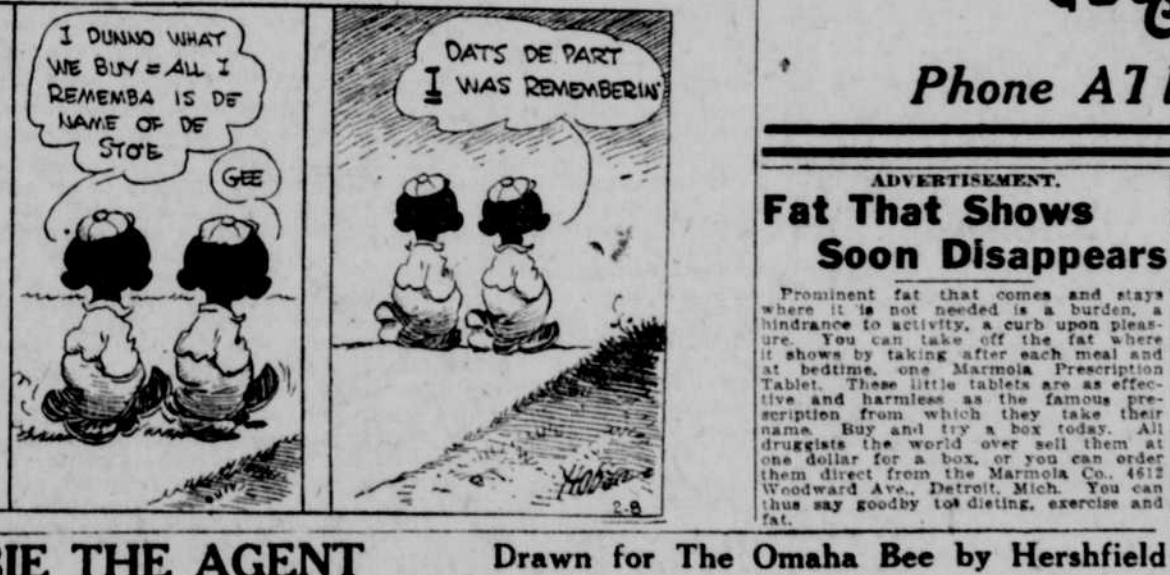
ADVEBTISEMENT. Fat That Shows Soon Disappears