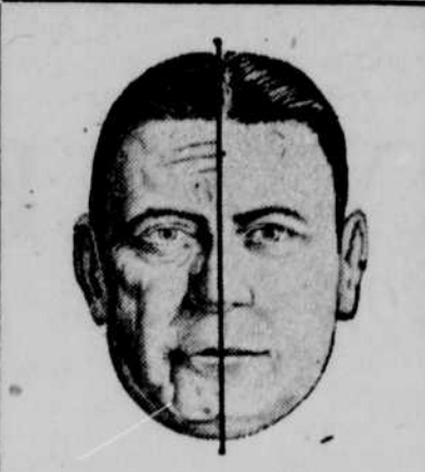
Prominent New York Facial Specialist Coming to Omaha Soon

Dr. Edwards' Olive Tablets act on the liver and bowels like calomelyet have no dangerous after effects. They start the bile and overcome constipation. Take one or two night ly and note the pleasing results. Mil ions of boxes are sold annually at 15c