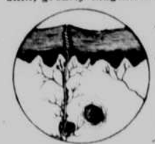
Cross-section of the skin, greatly magnified.

The outer skin—which Mercirex Soap cleanses, disinfects, and stimulates. The complicated true skin , where most skin troubles develop. Mercirex Cream penetrates here, eliminating the nucleus of pimples, blackheads, and eczema. It is also effective against most other ailments of the skin and scalp—such as boils, ringworm, sores, wounds, insect bites, plant poisons, and dandruff.