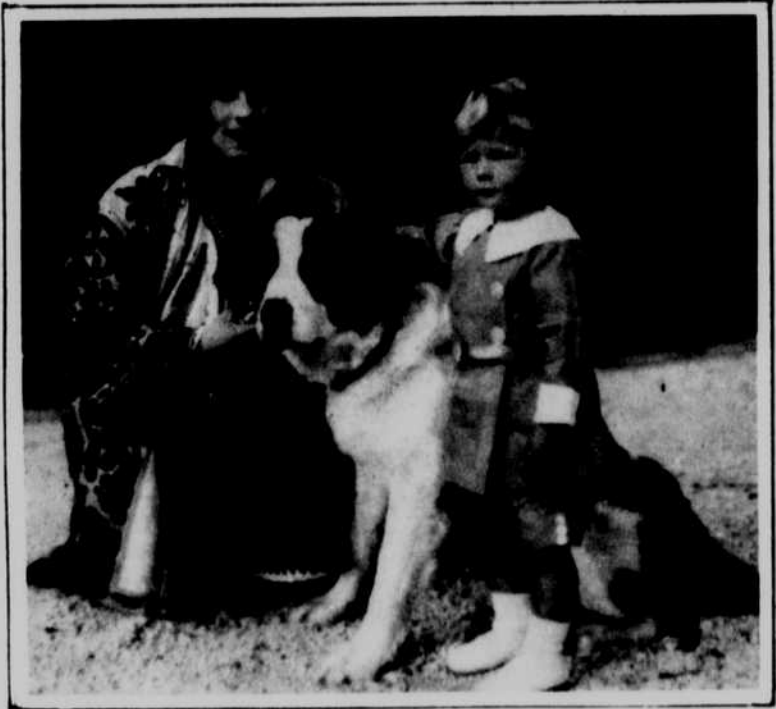
RUMANIA'S FUTURE KING, the handsome little Prince Michael, son of Crown Prince Carol of Rumania and Princess Elena of Greece, pictured with his mother and his favorite, St. Bernard. The youngster's paternal grandmother is Queen Marie of Rumania, his maternal grandfather the late ex-King Constantine.

MARMOLA COMPANY 225 Garfield Bldg. Detroit, Mich.