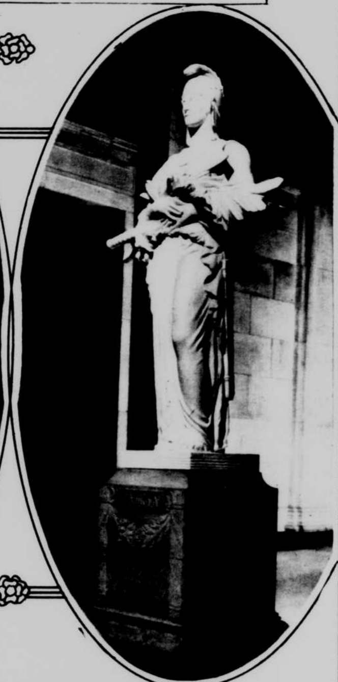
THE BANK OF MONTREAL'S WAR MEMORIALS, erected in commemoration of the 230 members of its staff who lost their lives in the World War. Both are by James E. Fraser, New York sculptor. The bronze soldier on the left is outside the bank's main branch in Winnipeg. The one on the right, Victory, nine feet high, of white marble, stands in the main office at Montreal.