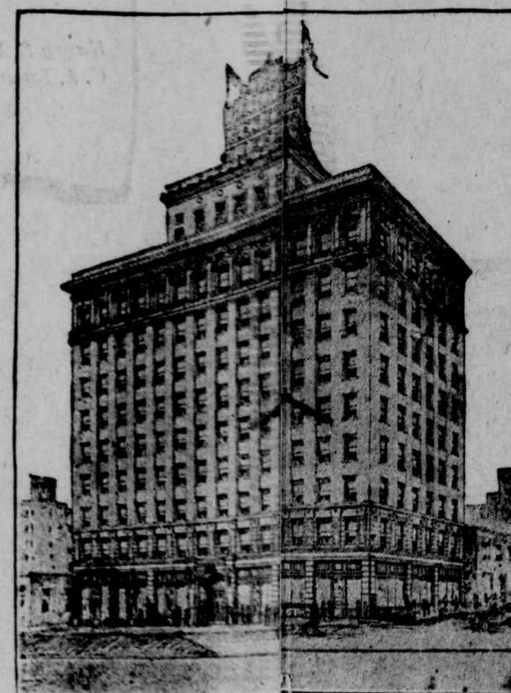
At 19th and Douglas Streets, Omaha

One of the Most Popular Legal Reserve Life Companies in the United States