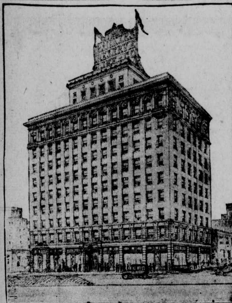
BANKERS RESERVE LIFE BUILDING Douglas at Nineteenth

Those who are interested in securing accommodations in the Bankers Reserve Life Building should call up AT lantic 3024. A small amount of choice space is still available.