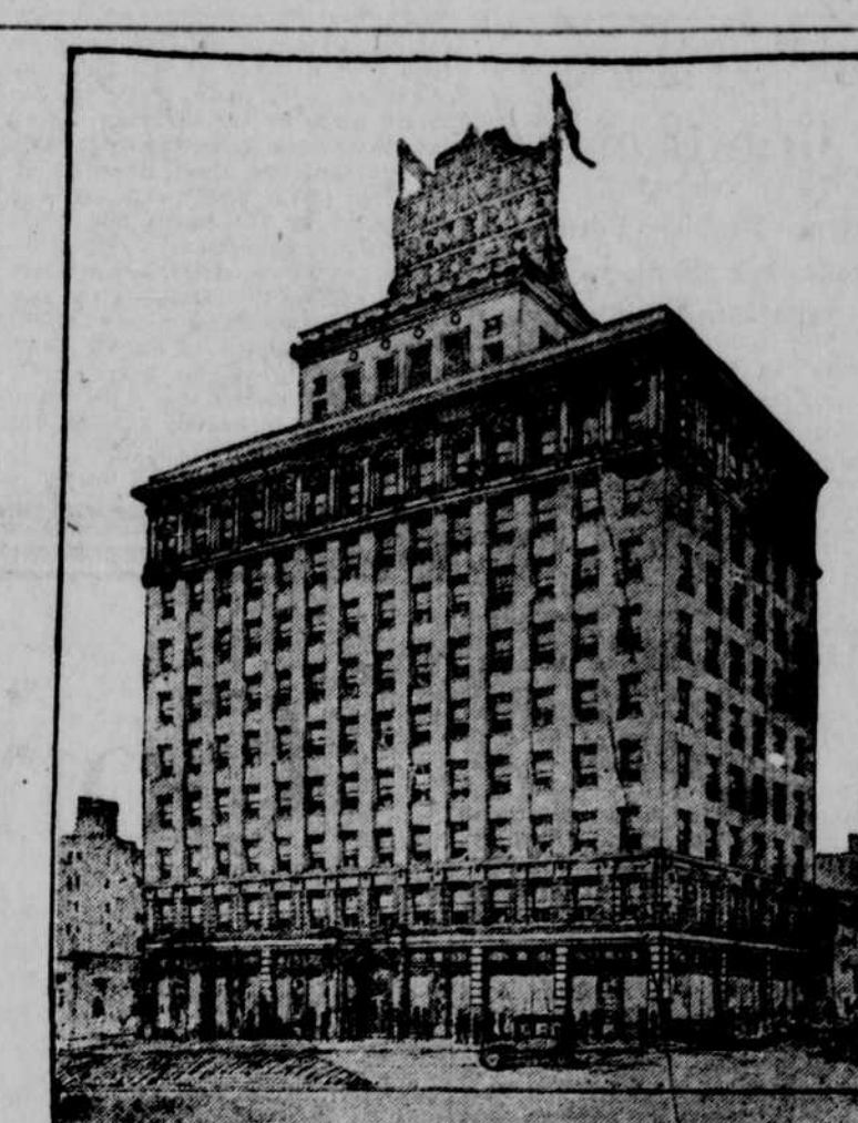
BANKERS RESERVE LIFE BUILDING Douglas at Nineteenth