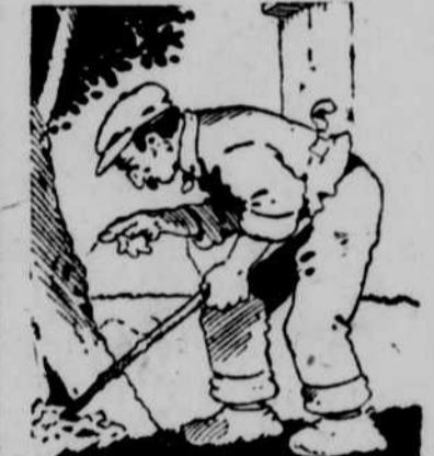
Much time was spent hunting for the lost things and for traces of the thief.

If ever there were puzzled men those men were the workmen who were repairing the broken airplane, which had fallen with Danny and Nanny Meadow Mouse. A lot of screws and nuts and washers had disappeared. At first some of them thought that somehow these things had been left behind, but when it was pointed out to them that the little boxes which had contained the screws and nuts and washers were there, but filled with pebbles, they didn't know what to say. Now, if there had been a lot of human neighbors the workmen would have been sure that some dishonest person had stolen those small parts of the great man-bird. But there were no human neighbors for miles and miles. There were only the man and his wife who owned the garden on the edge of which the airplane had fallen, and the workmen knew that they were honest and had not touched the things. The loss of these screws and nuts interfered sadly with the work of repairing the airplane. It meant that unless they could be found some one would have to go many miles to get