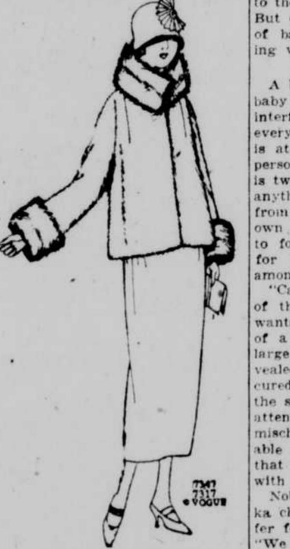
A Young Girl's Coat.

Despite the popularity of the long coat and the three-quarter coat, the jaunty little short coat has made a sure place for itself in the mode, especially in the mode for the young girl.