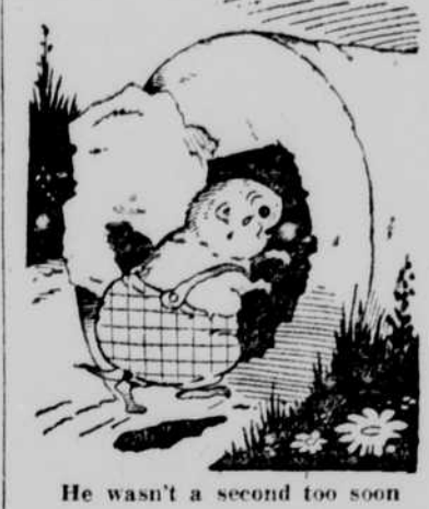
He wasn't a second too soon