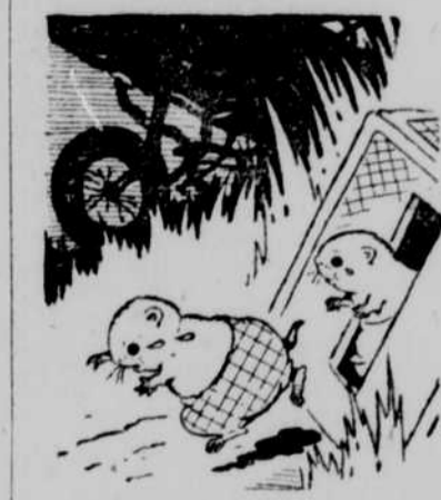
They scrambled to their feet and out of that open door

To Danny and Nanny it looked as if the earth were rushing up to meet them. How fast it came up! The aviator was now giving his whole attention to guiding the great man-bird. In the distance ahead Danny saw what looked like a tiny house. The house grew bigger and bigger and bigger. The gray patch grew bigger and bigger and bigger. Both house and the gray patch seemed to be coming right up to them. Pretty soon they saw that the gray patch was a sandy field, with things growing in it. Then they guessed