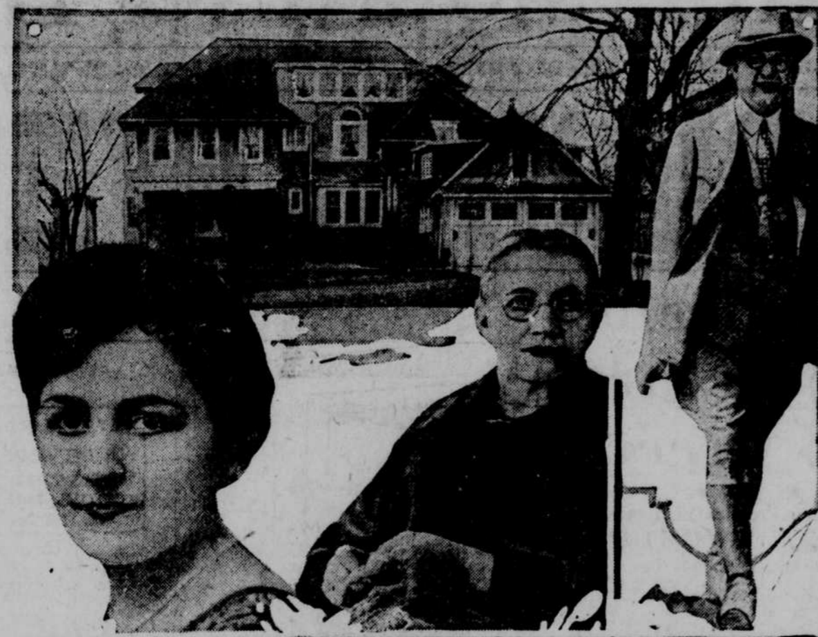
A world-wide search is being conducted for Leo Koretz, Chicago "financier," who has disappeared, after securing $7,000,000 in selling stock for a South American venture which did not exist.