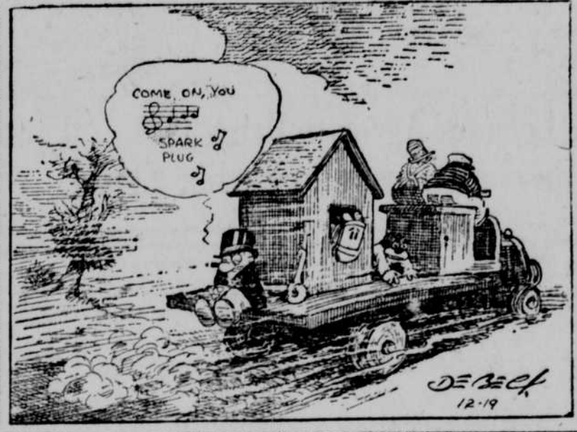
Drawn for The Omaha Bee by McManus