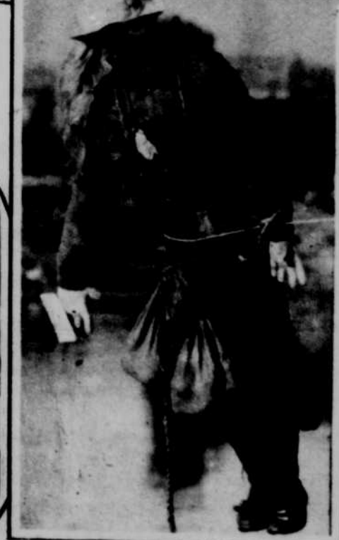
NOT DANNY DEEVER, but "Old Man Detour" — the obsequies featuring the opening of the Pacific Highway as a continuous boulevard across Oregon and Washington from British Columbia to the California line. "Old Man Detour" was hoisted over the side of the interstate bridge across the Columbia River and lowered to a watery grave. P. A. A.

BEDDEO 1415-17 Douglas St. Every red blooded Omaha boy needs clothes that will stand strain and yet be full of good style. BEDDEO'S BOYS' SUITS More Than Make Good