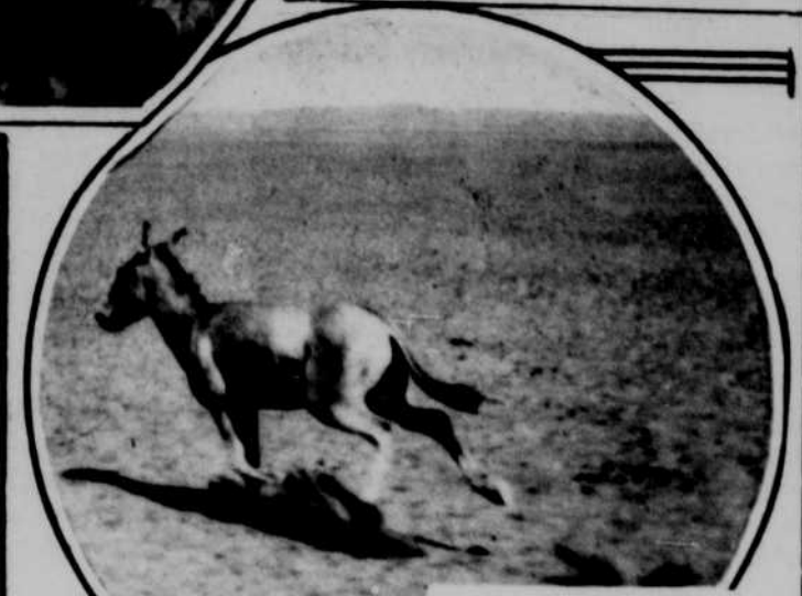
PHOTOGRAPHED FOR THE FIRST TIME. A remarkable picture of a wild ass of Mongolia "crossing the bows" of the Roy Chapman Andrews Asiatic expedition at forty miles an hour. A herd of the animals was chased twenty-nine miles across the desert wastes by the members of the party in autos before one was finally captured. Hamilton Wright.

BEDDEO 1415-17 Douglas St. Every red blooded Omaha boy needs clothes that will stand strain and yet be full of good style. BEDDEO'S BOYS' SUITS More Than Make Good