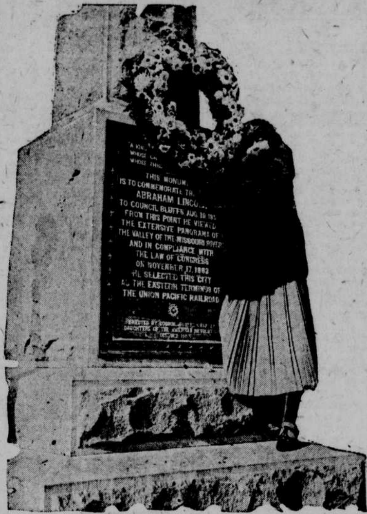
The spot where the west began, marked by Lincoln monument at Council Bluffs, Ia., was decorated by D. A. R. on 60th anniversary of signing of bill by Lincoln.