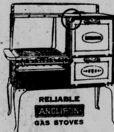
RELIABLE ANGLIPON GAS STOVES

This is your chance to buy a new Gas Stove with all of the newest features and improvements. Pay small monthly payment with Gas Bill. Convenient to pay and easy to pay. The prices are so low that these ranges should not last long.