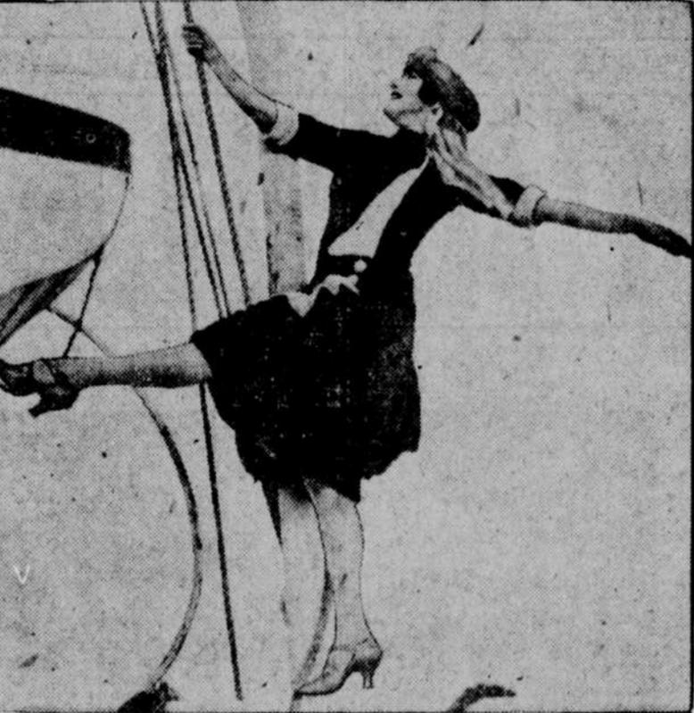
San Francisco, Cal.—Annette Kellerman, the world famous swimmer, arrived in San Francisco November 20, on the steamer Tahiti from Australia.

Miss Kellerman gained the right to enter this country without the usual lineup with foreigners as a result of her marriage to James R. Sullivan.