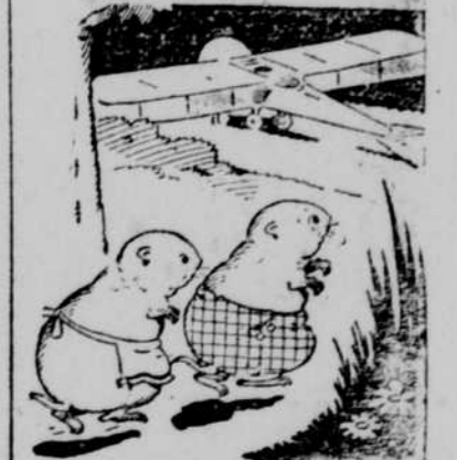
Finally she ventured to go over near it in the night with Danny Meadow Mouse.

Chronic coughs and persistent colds lead to serious lung trouble! You can stop them now with Creomulsion, an emulsified creosote that is pleasant to take. Creomulsion is a new medical discovery with two fold action: it soothes and heals the inflamed membrane and kills the germ. Of all known drugs, creosote is recognized by medical fraternity as the greatest healing agency for the treatment of chronic coughs and colds and other forms of throat and lung troubles. Creomulsion contains, in addition to creosote, other healing elements which soothe and heal the inflamed membrane and stop the irritation and inflammation, while the creosote goes on to the stomach, is absorbed into the blood, attacks the seat of the trouble and destroys the germs that lead to consumption. Creomulsion is guaranteed satisfactory in the treatment of chronic coughs and colds, bronchial asthma, catarrhal bronchitis and other forms of throat and lung diseases, and is excellent for building up the system after colds or the flu. Money refunded if any cough or cold, no matter of how long standing, is not relieved after taking according to directions. Ask your druggist. Creomulsion Co., Atlantic, Ga.