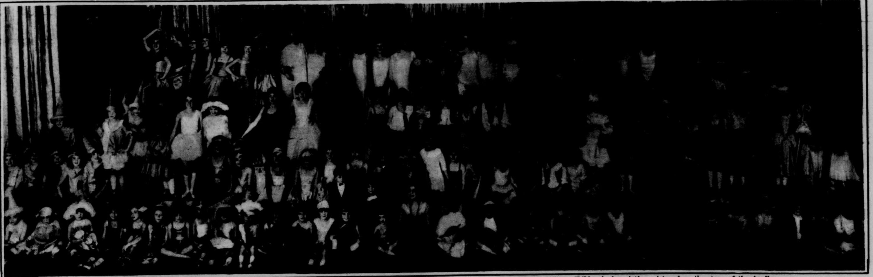
ONE HUNDRED AND FIFTY THOUSAND JUVENILES, young stage artists being educated under the patronage of the National Stage Children's Association, pictured on the stage of the Apollo Theater New York recently following their musical revue, "Cheer Up, America," at which twenty-seven received scholarships in dramatic, music or dancing academies. Those who didn't were kissed by Governor Smith.