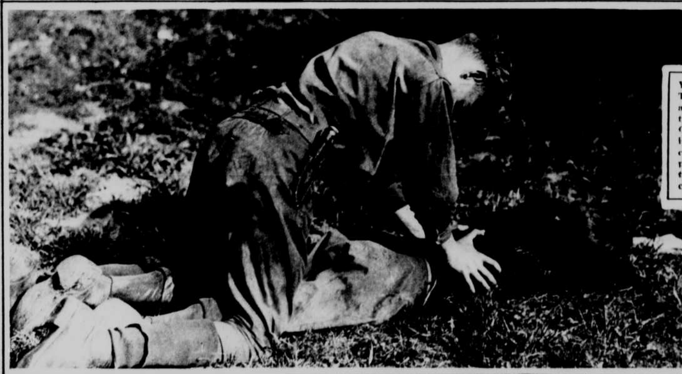
Yes, this is not a scalping scene. The knife may be as murderous as it looks, but it isn't used in this exercise. This is merely an Omaha Boy Scout demonstrating the proper method of resuscitating an apparently drowned person. Every scout must know this before reaching the second class.