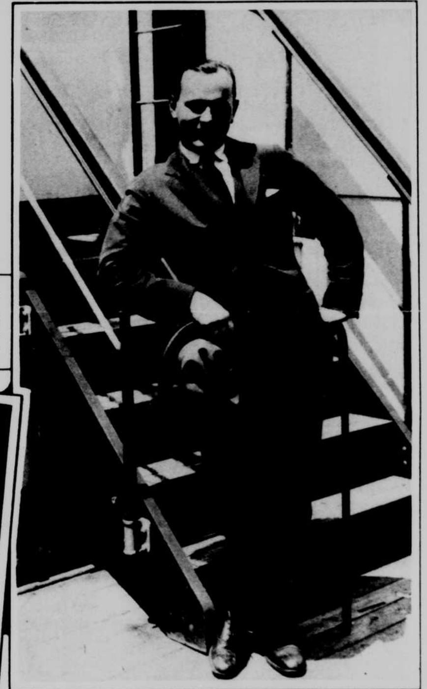
Where to? Perhaps Billy De Beck is taking Barney and Sparkplug around the world. Or maybe he's just taking the night boat to Albany. Watch the comic page of The Omaha Bee and perhaps you'll get the truth of it.