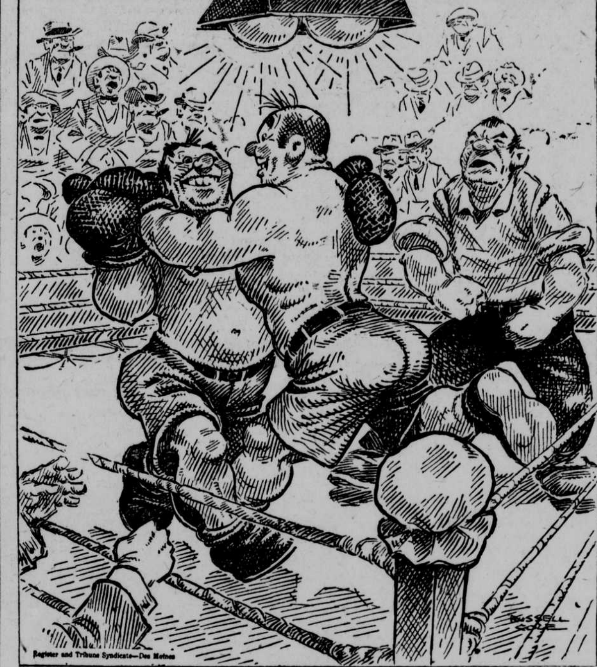
Fans find flaic furles form figures for future. Take on the Title Contest and may be you'll score a knockout.

Purses are as follows: First prize, $5, to the person who hands in the best title to the picture above. Second prize, five in number, are $1 each.