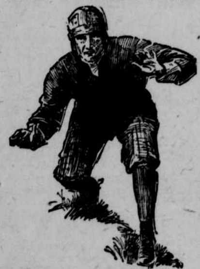
This Man Is Ruptured Yet Plays Football Safely—Because He Uses A BROOKS APPLIANCE

Just because you are unfortunate in being ruptured is no good reason why you should not freely engage in every form of athletic sport, dancing, skating and all amusements. A Brooks Appliance will hold firmly yet with perfect comfort at all times and under all conditions. There are no hard pads nor springs of any kind about a Brooks Appliance. A soft, pliable rubber air cushion is so shaped as to firmly cling to the body and hold the rupture back just as you would do with the pressure of your hand.