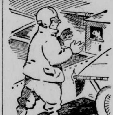
The Next Story: "Danny Finds He Has a Friend."

had come back to do some work on the man-bird. Danny had pulled the little piece of bread crust inside the cupboard and had eaten it there. He poked his head out to get another piece just as the aviator looked in the machine. They saw each other at the same instant. Danny darted back into the tiny cupboard. "Well! Well! Well! I must have had a passenger and didn't know it!" exclaimed the aviator. "That mouse must have gotten in back where I started on the Green Meadows. I wonder what he thought of his ride. I'll see if I can't keep him." He reached over and closed the little door of the tiny cupboard. Danny Meadow Mouse was a prisoner. Then Danny wished he hadn't climbed back into that big man-bird. But really he had done the wise thing. He didn't know it, but he had done the wise thing. He was safe there, whereas he wouldn't have been safe at all if he had tried to cross that great, bare, open space. (Copyright, 1923.)