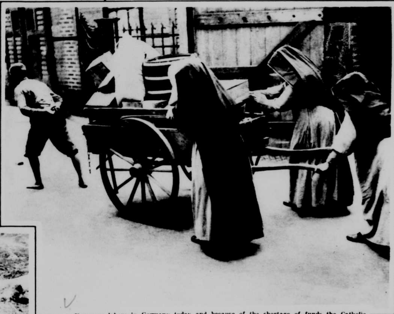
Everyone labors in Germany today and because of the shortage of funds the Catholic sisters in the Berlin orphan home are forced to do all kinds of manual labor. Unable to pay for delivery of food and other supplies for the home the sisters, with the aid of one lone orphan, are shown pulling flour and other supplies through the streets of Berlin.

I care not where the germ sought root, In loams or the poorer clays, So that the health of the sun were there, And hours of the normal days. Then I'd have a tree that would show some height, And whose branches should reach around; A restful thing for mine eyes to see, As I'd lie in its shade, on the ground.