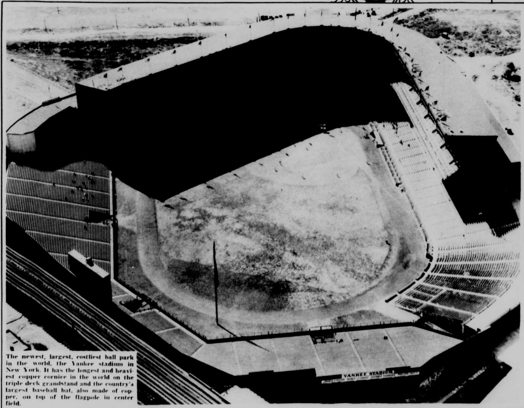
The newest, largest, costliest ball park in the world, the Yankee stadium in New York. It has the longest and heaviest copper cornice in the world on the triple-deck grandstand and the country's largest baseball bat, also made of copper, on top of the flagpole in center field.