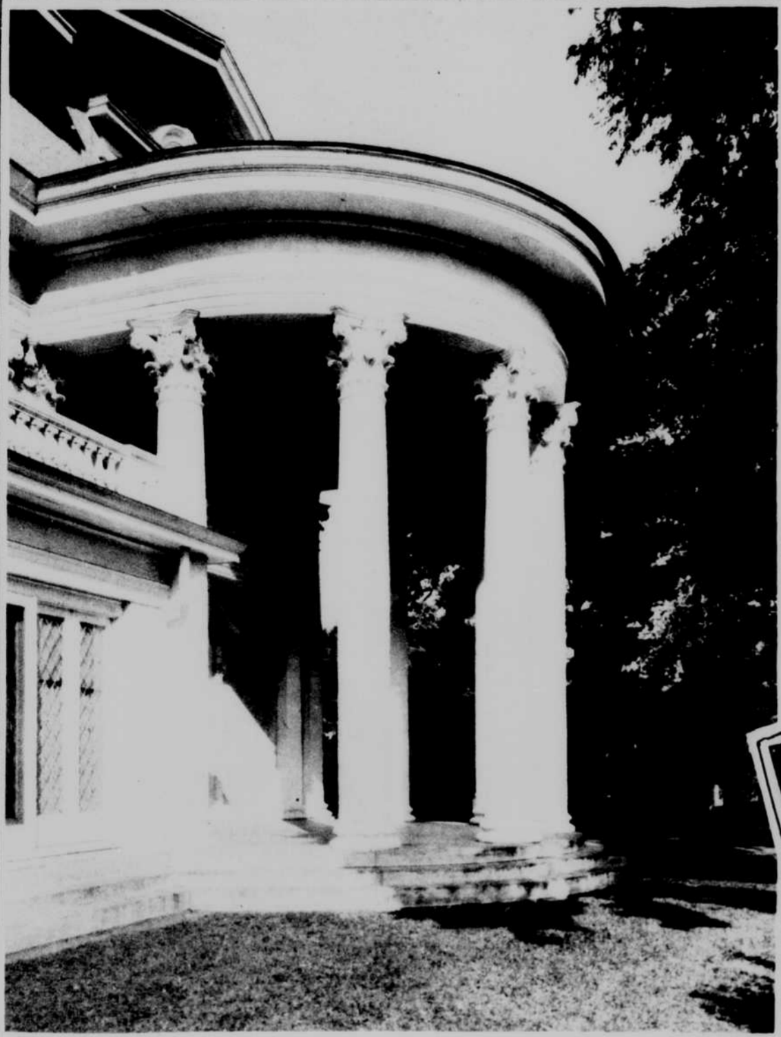
South portico of Arbor Lodge.

THE HOMESTEAD OF J. STERLING MORTON AT NEBRASKA CITY IS FORMALLY TRANSFERRED TO THE STATE OF NEBRASKA.