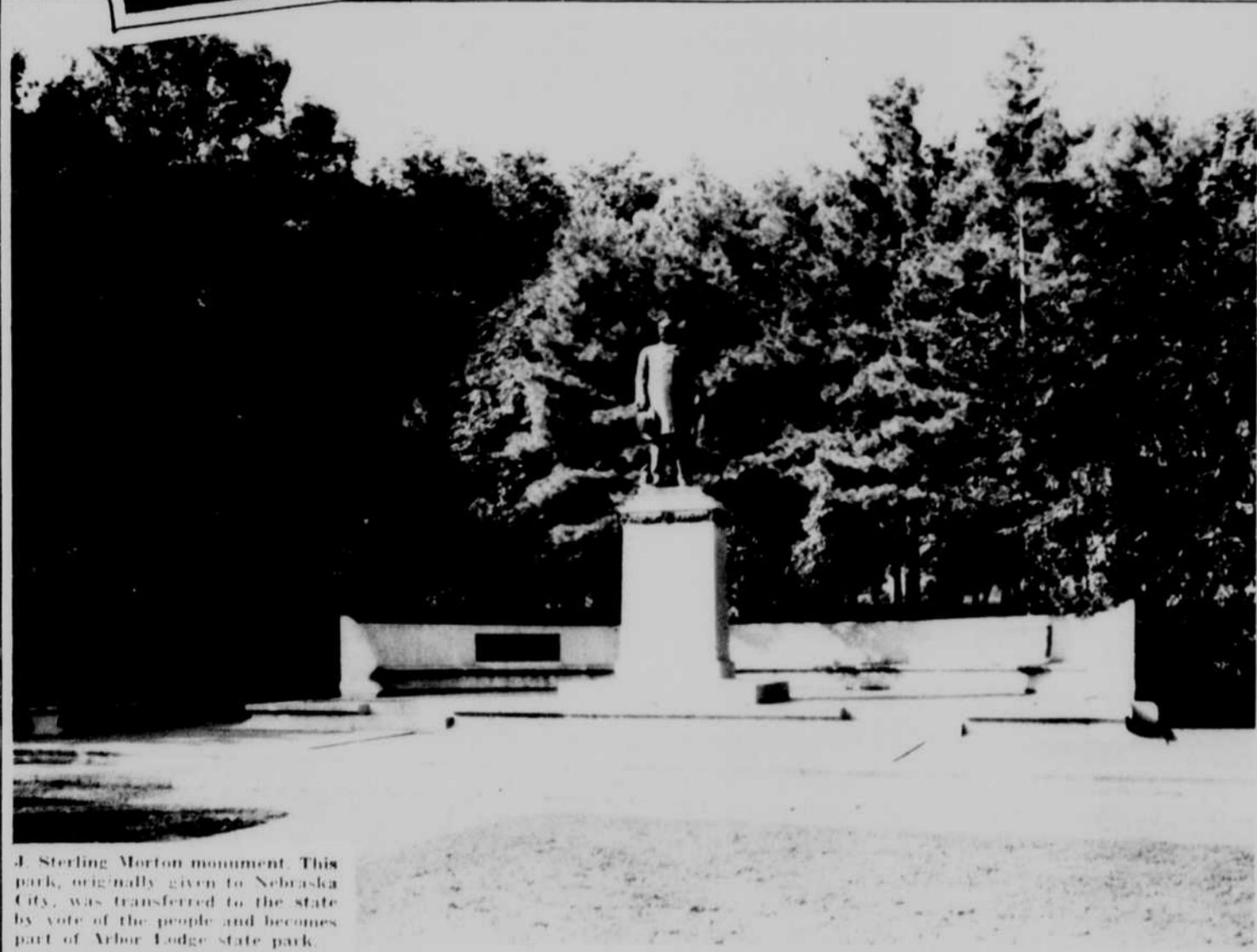
J. Sterling Morton monument. This park, originally given to Nebraska City, was transferred to the state by vote of the people and becomes part of Arbor Lodge state park.