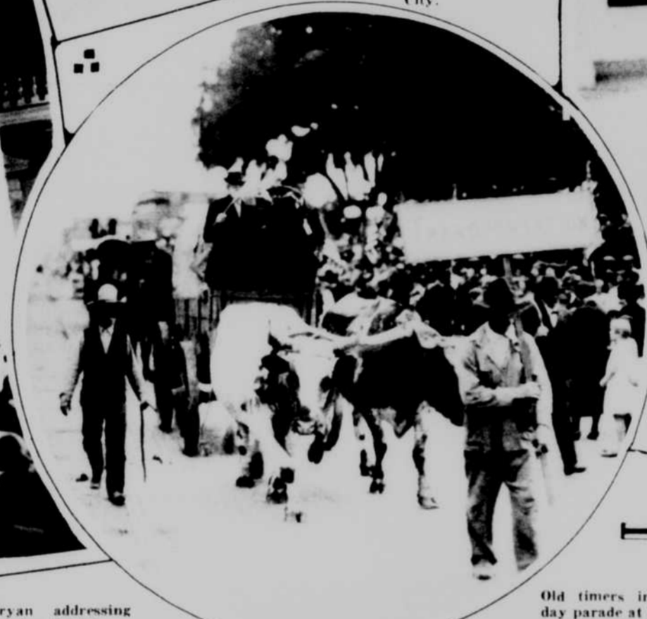
Old timers in the transfer day parade at Nebraska City.