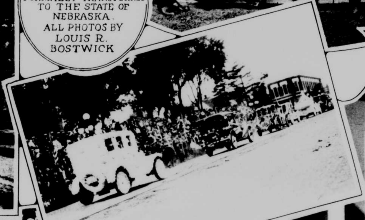
Parade of automobiles on transfer day at Nebraska City.