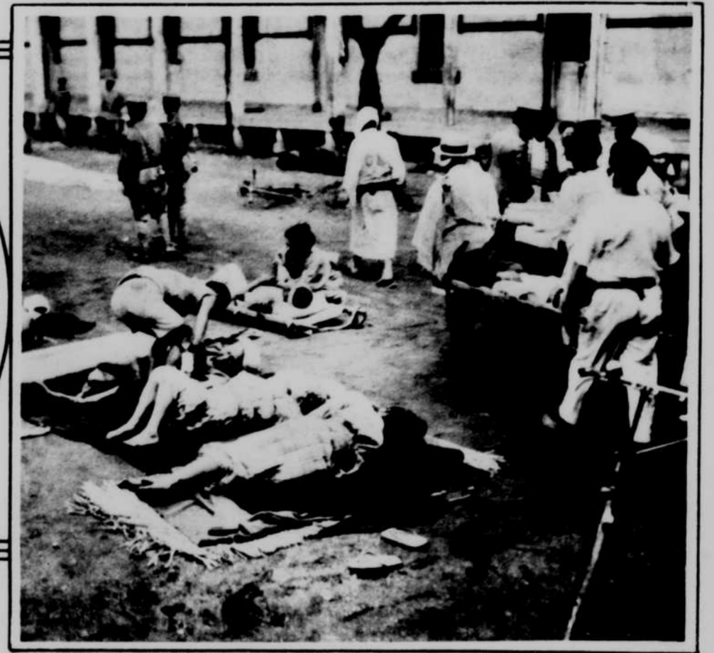
A PITIFUL STREET SCENE IN TOKYO just outside of the army hospital showing a number of the earthquake sufferers lying on blankets awaiting medical attention. At the right, native stretcher bearers are bringing in other injured victims of the worst disaster in Japan's history.