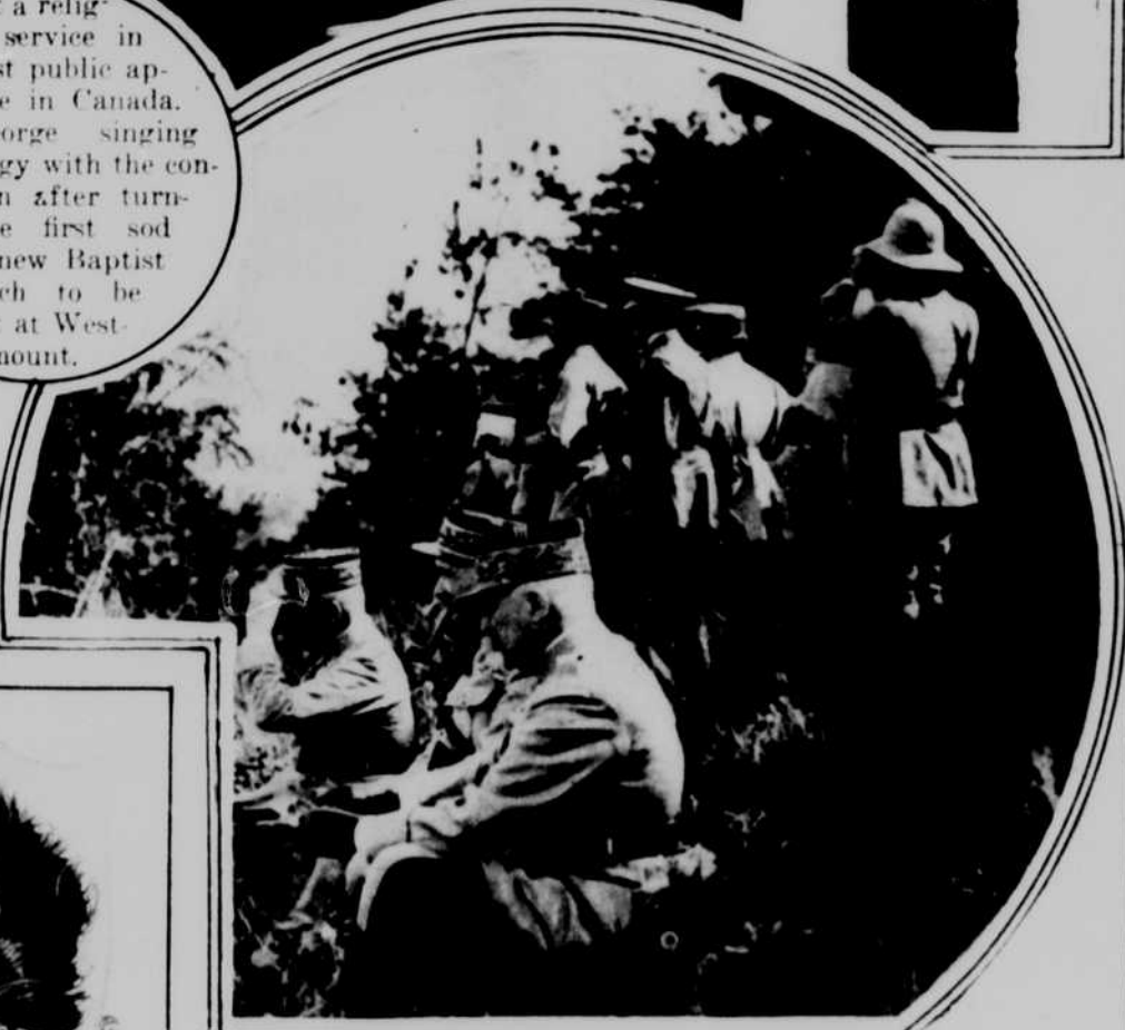
A reconnaissance in the valley of the Rhone, Marshal Petain and members of his staff observing the movements of troops in the annual French army maneuvers.