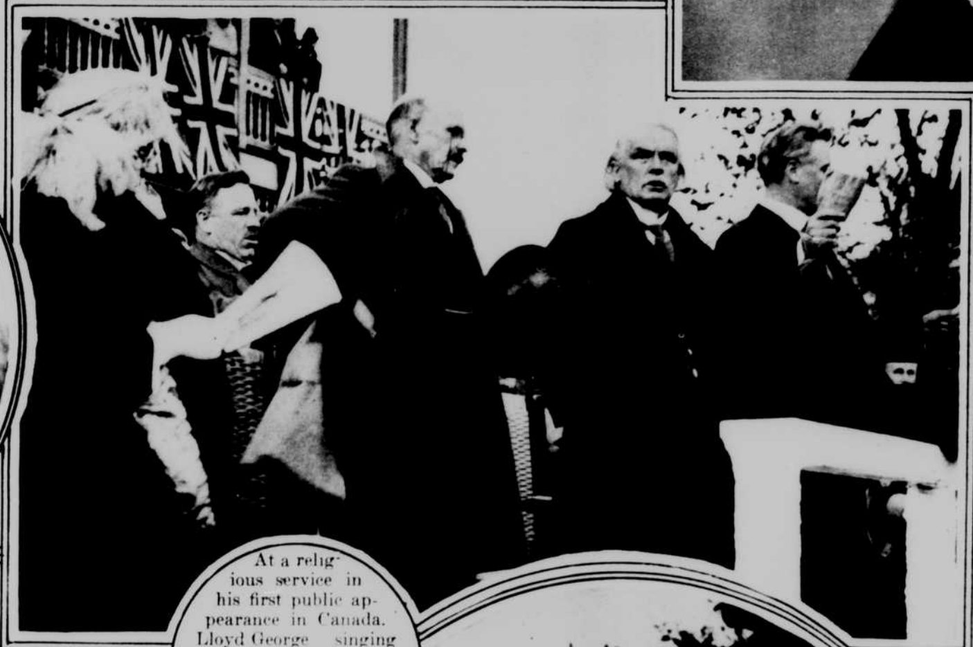
At a religious service in his first public appearance in Canada, Lloyd George singing the Doxology with the congregation after turning the first sod for a new Baptist Church to be built at Westmount.