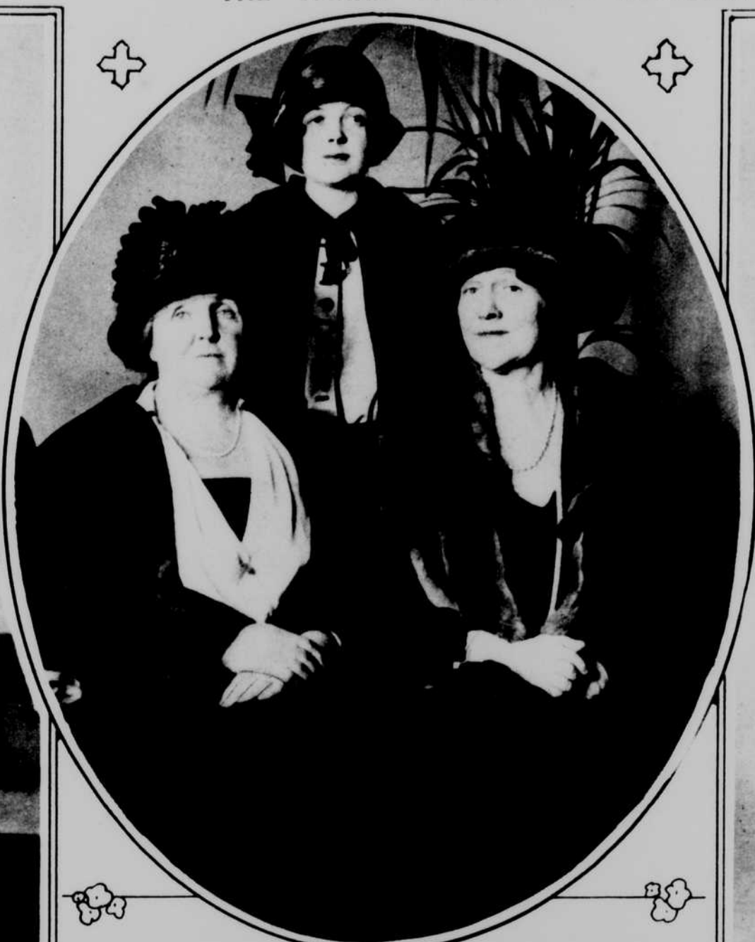
Mrs. David Lloyd George and her daughter, Miss Megan, with Mrs. Charles Dana Gibson, sister of Lady Astor, at the Biltmore while England's war premier was being entertained at a luncheon.