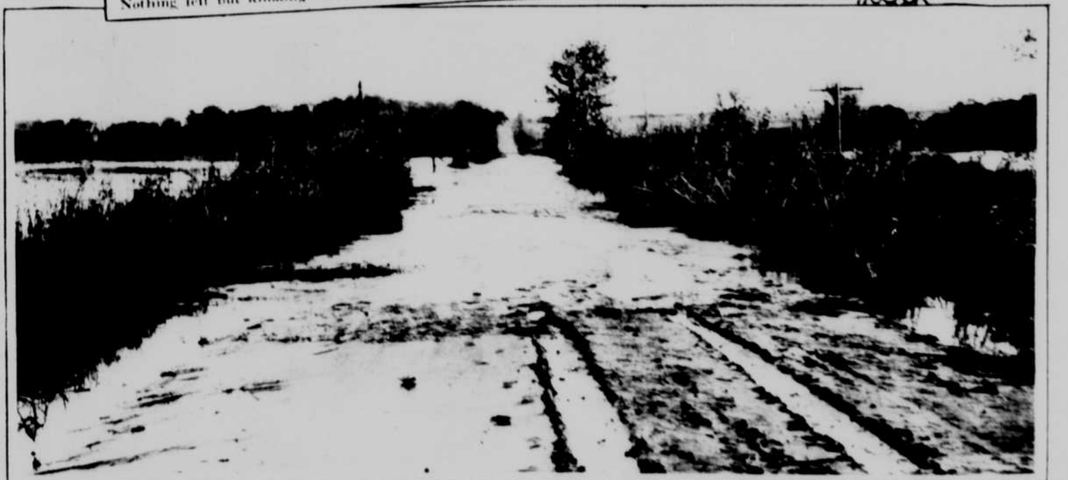
On the P.E.D. along the Blue River