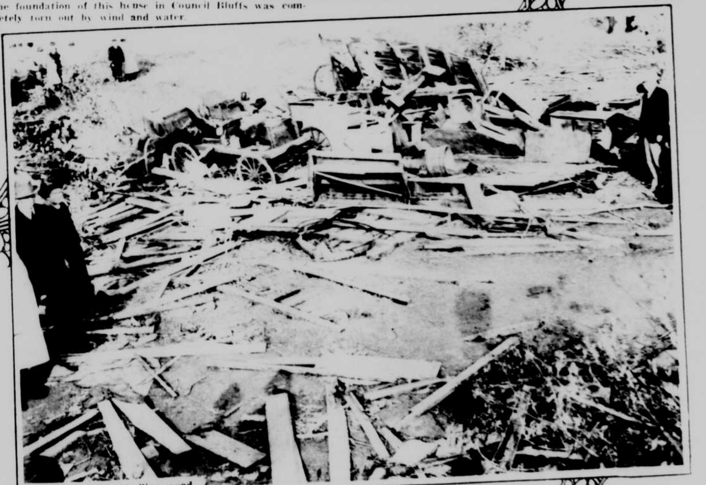
Nothing left but kindling wood