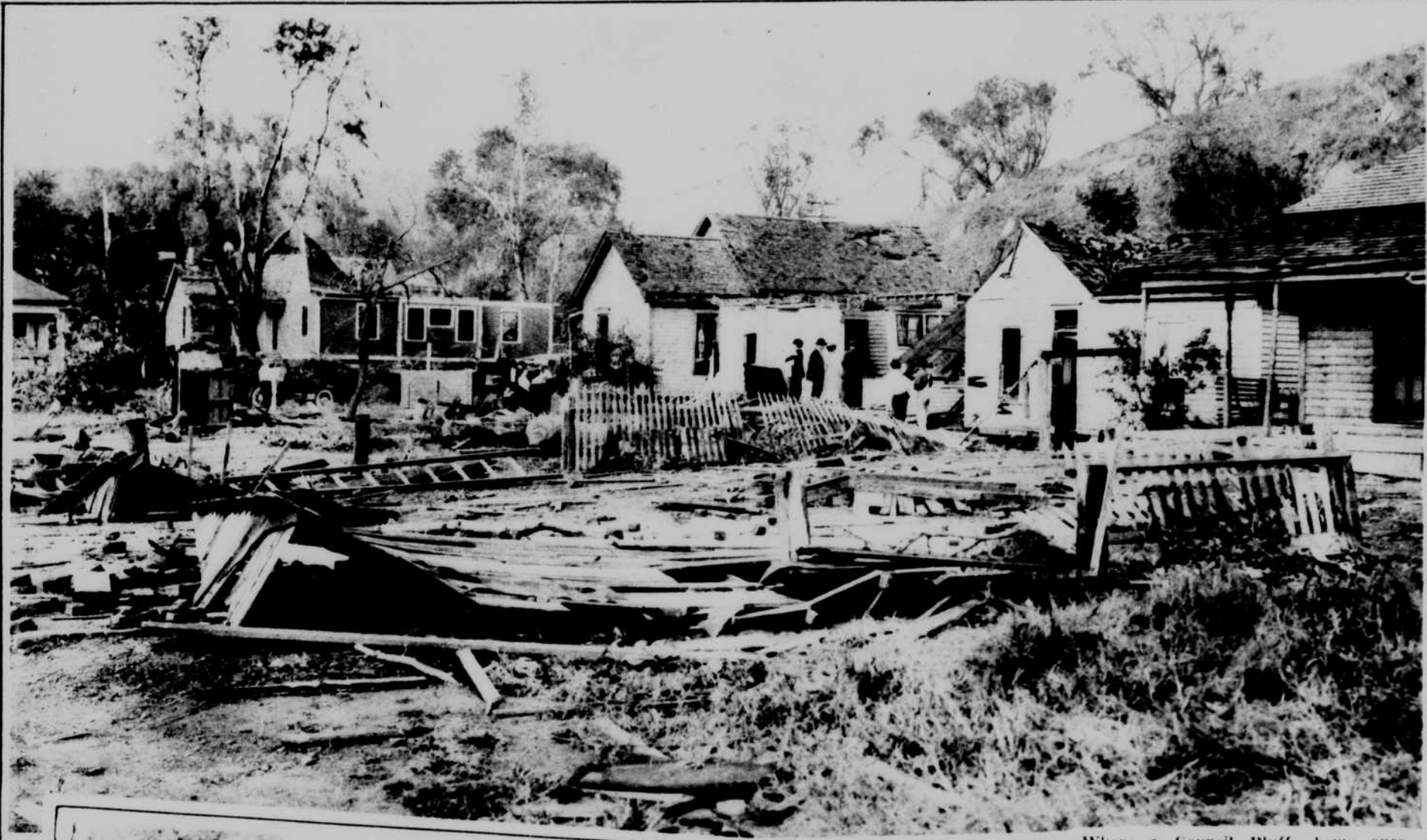
Where a Council Bluffs home once stood.

SOME STRIKING ILLUSTRATIONS OF THE DAMAGE DONE IN NEBRASKA AND COUNCIL BLUFFS BY CLOUDBURST AND TWISTER