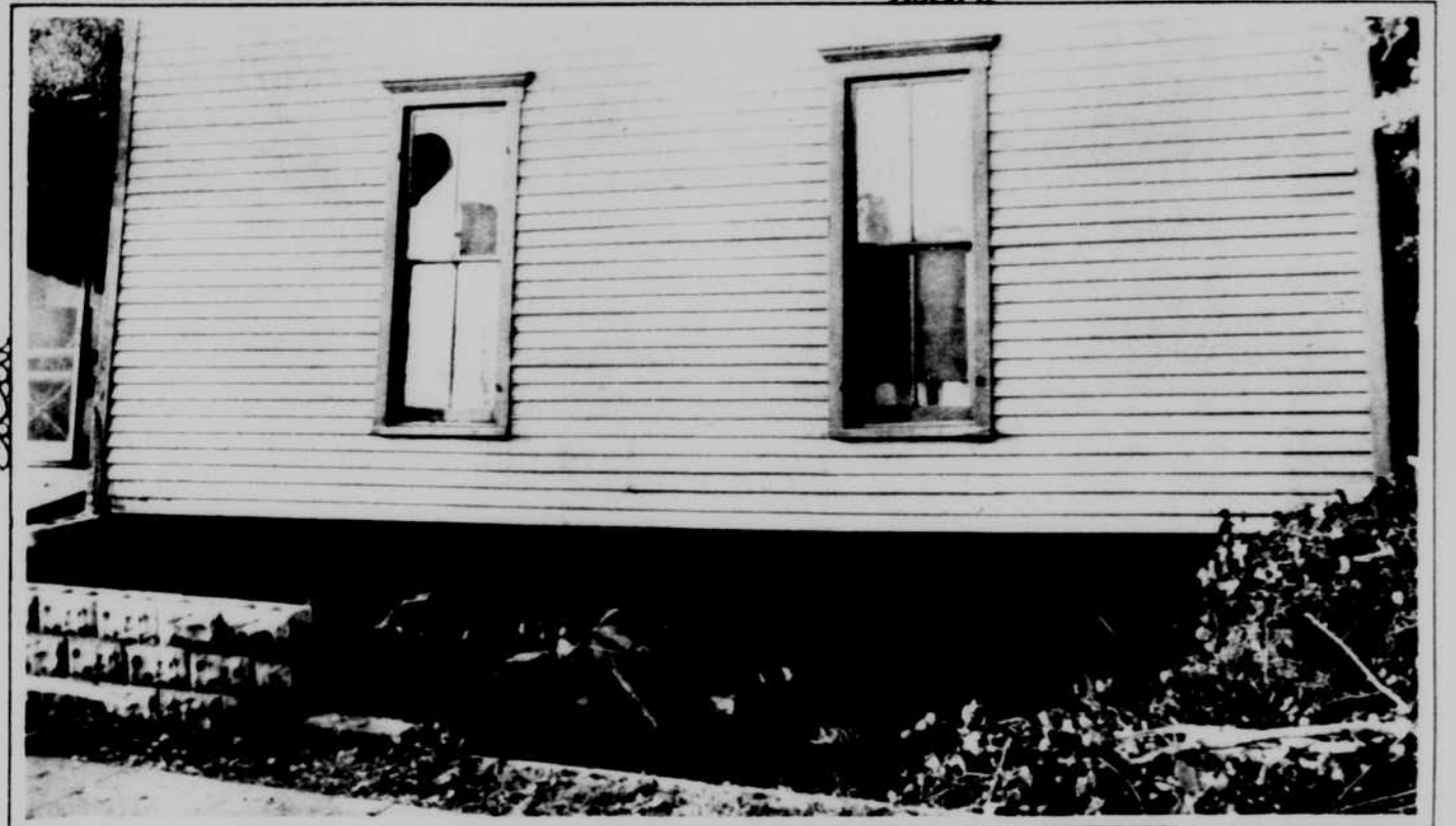
The foundation of this house in Council Bluffs was completely torn out by wind and water.