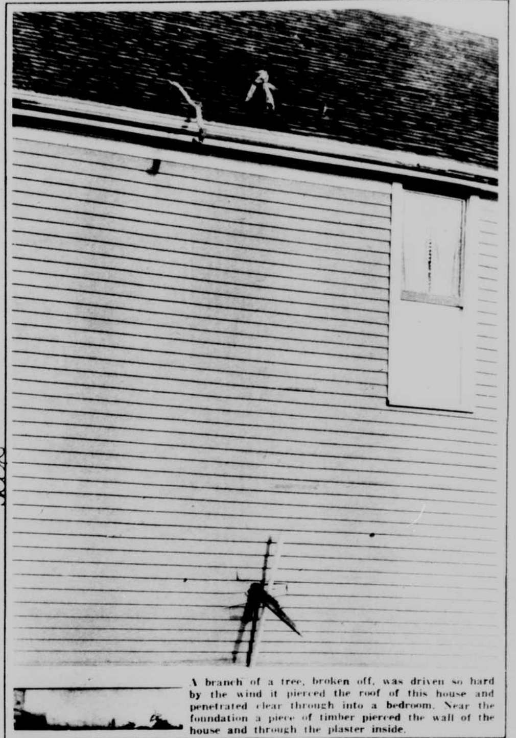
A branch of a tree, broken off, was driven so hard by the wind it pierced the roof of this house and penetrated clear through into a bedroom. Near the foundation a piece of timber pierced the wall of the house and through the plaster inside.