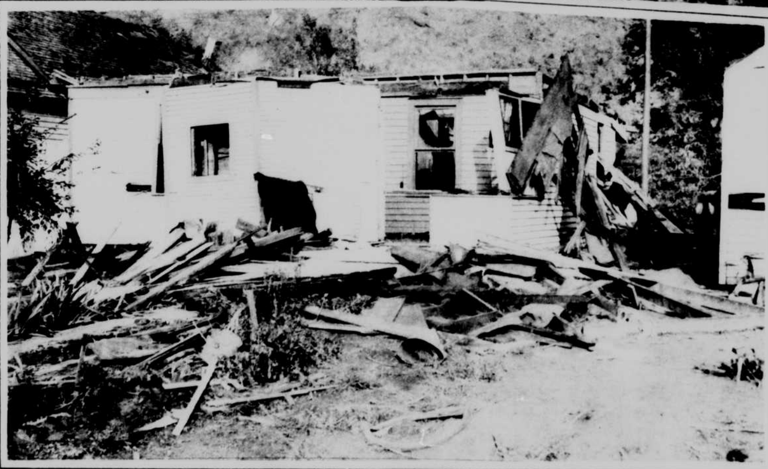
The wreck of a frame dwelling.