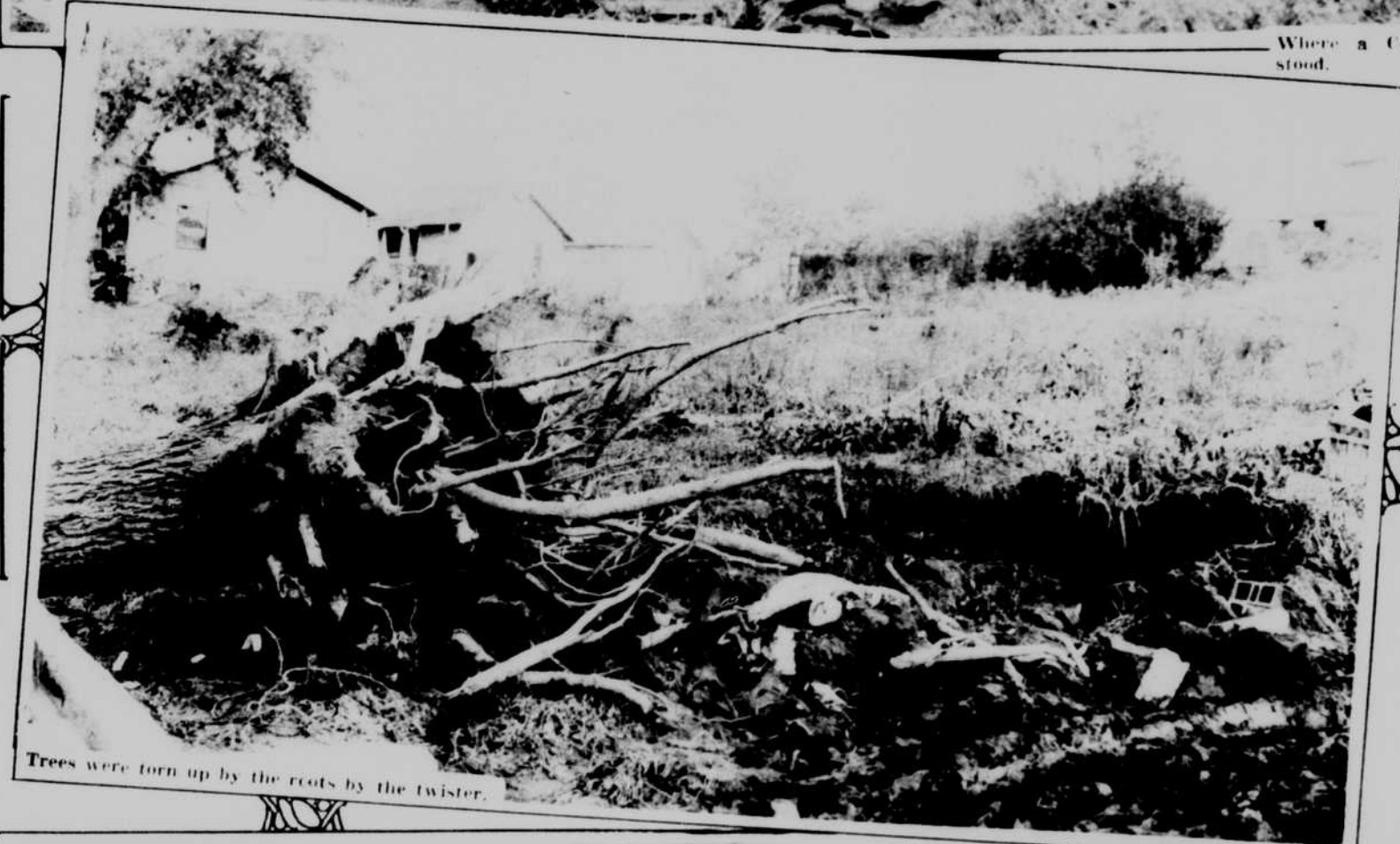
Trees were torn up by the roots by the twister.