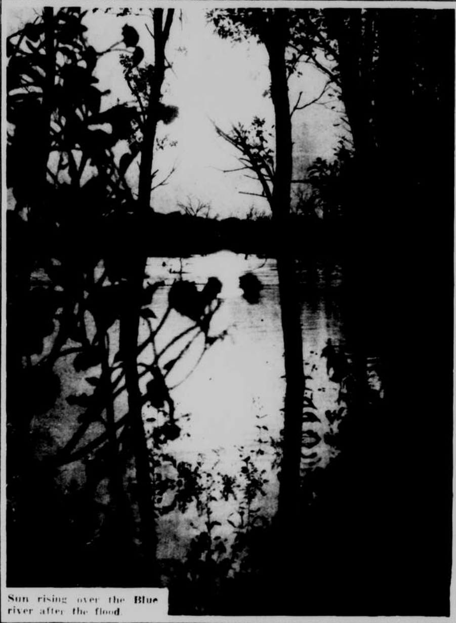
Sun rising over the Blue river after the flood.