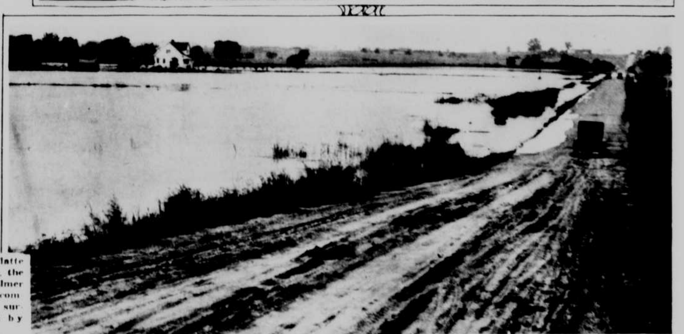
In the Platte valley, the home of Edmer Harris completely surrounded by water.