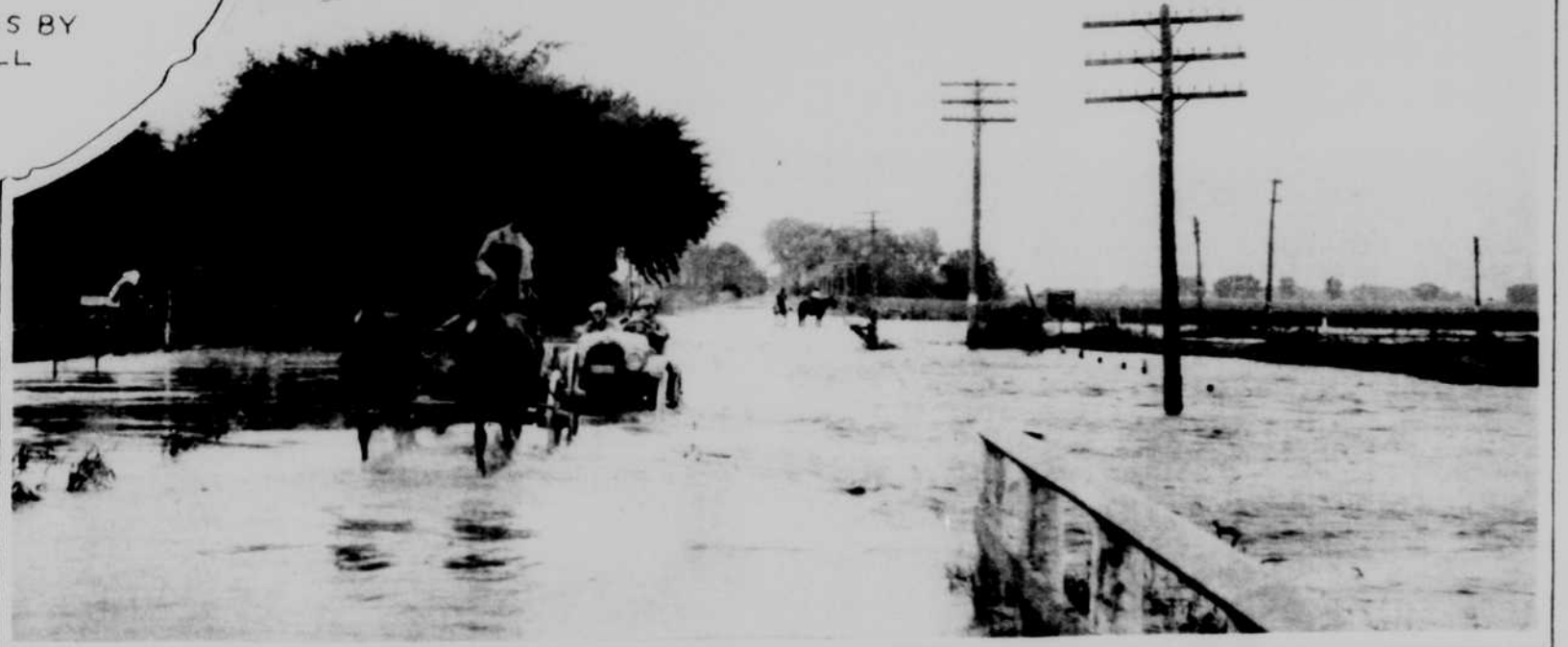
Old Dobbin and his brother help their owner pick up a few dollars rescuing marooned motorists at Ashland, Neb.