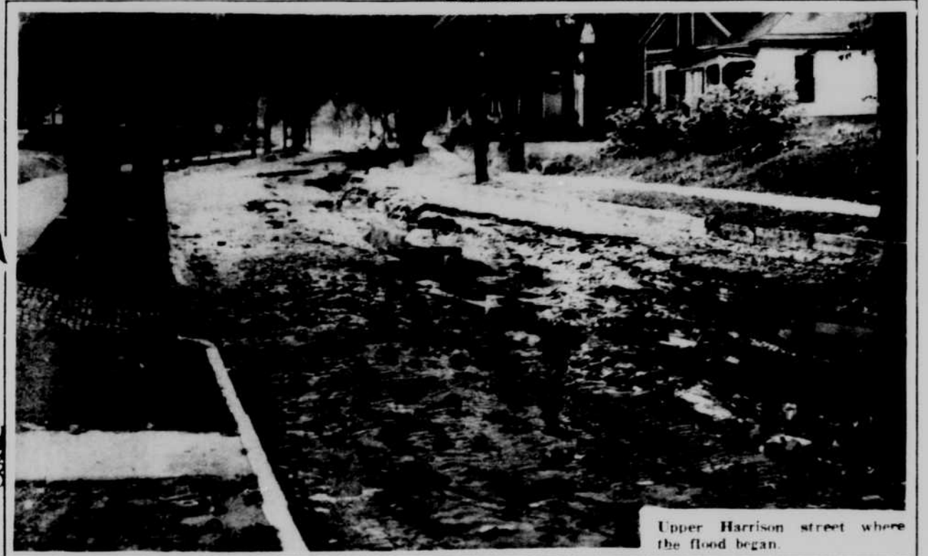
Upper Harrison street where the flood began.