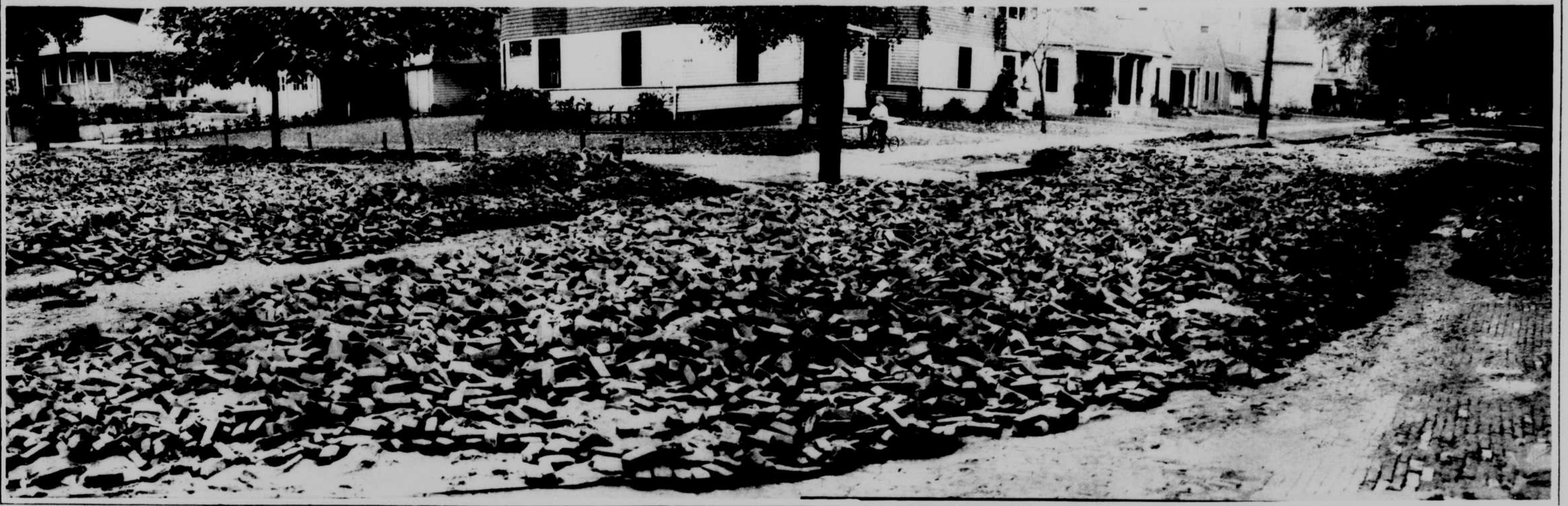
Intersection of Harrison street and Washington avenue in Council Bluffs. Water rushing down Harrison street undermined the brick paving and then turned into Washington avenue with similar devastation.