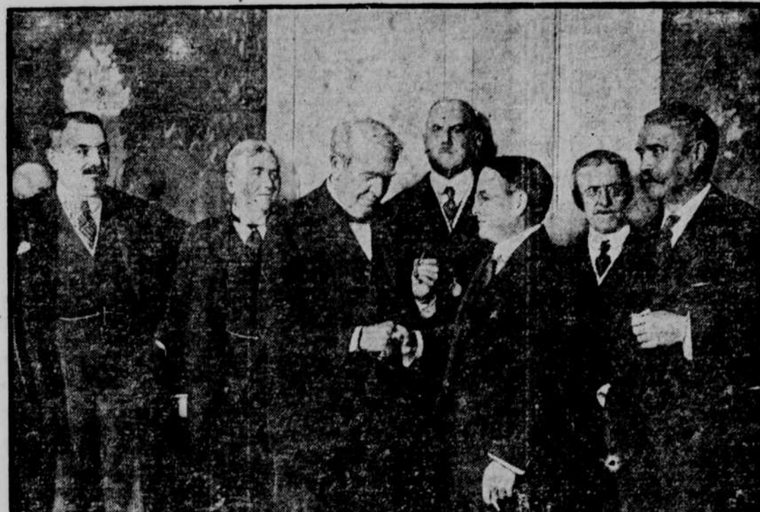
At opening of electrical and industrial exposition in New York many friends gathered around Thomas Edison, the wizard inventor. Edison was spry and shook hands with them all.