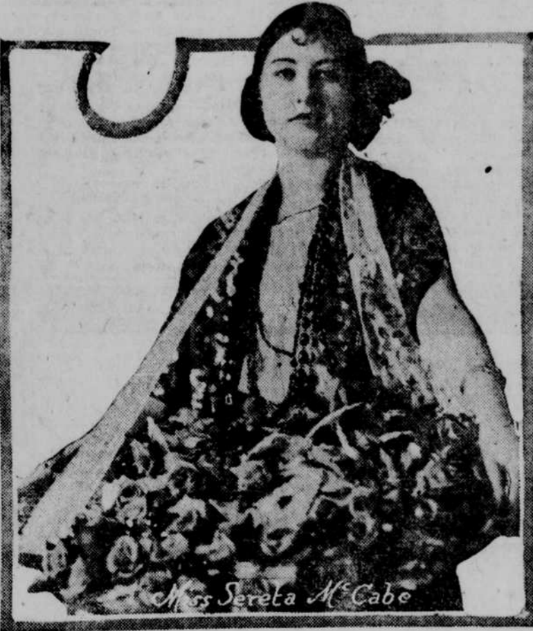
Friday Photo, Columbus.