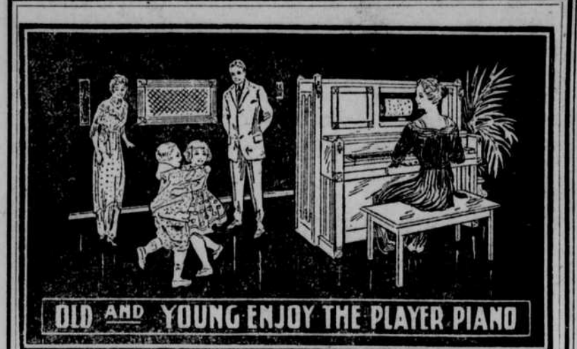
OLD AND YOUNG ENJOY THE PLAYER PIANO