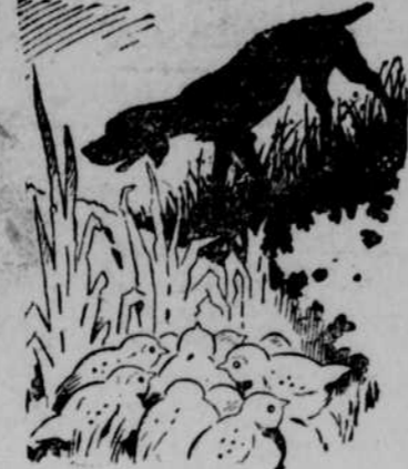
So they squatted close to the ground and waited.

By THORNTON W. BURGESS. Some dreadful things are sometimes needed to make the voice of wisdom heard. —Bob White. The Dreadful Yession of the Young Bob Whites. The young Bob Whites over in the wheat field had not been very much frightened when they had discovered the dog which had found them. They had seen dogs many times and never had they heard of a dog catching a Bob White. The first one to discover that dog warned the others and they all squatted close to the ground and waited for what that dog might do. They heard their father, Bob White, calling from a fence post to fly, but