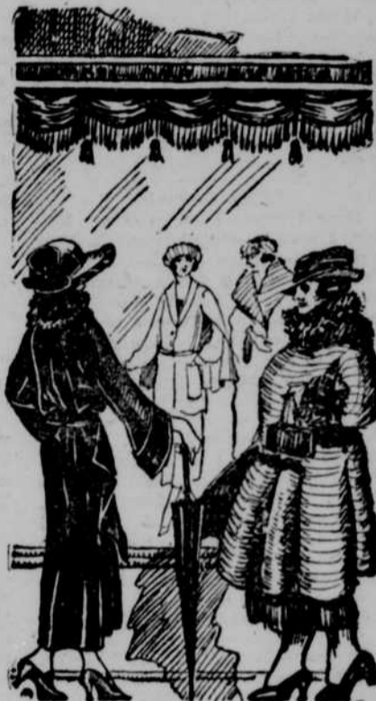
Notice How Much More Attractive the Slender, Graceful Figure Is.

Why not declare your independence today—right now—by writing for a free sample of Rid-O-Fat and prove to yourself that you can be as attractive and gracefully slender as you wish?