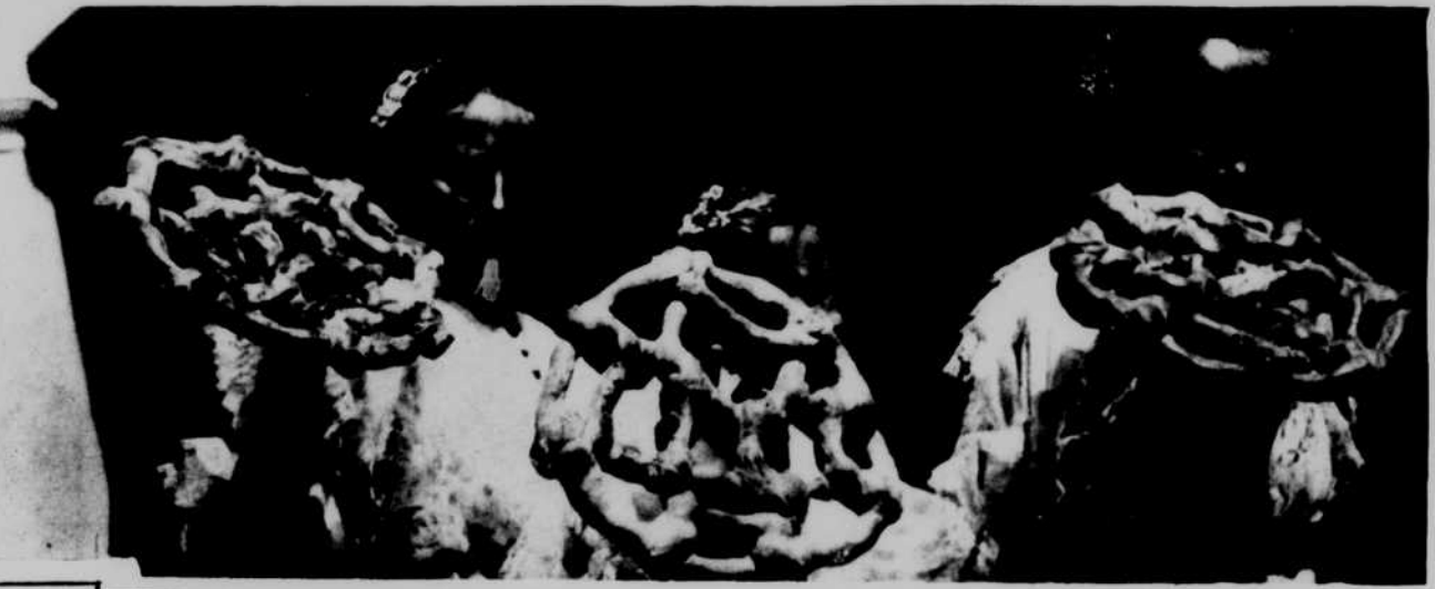
Right — WEDDING PRETZELS. Hungarian Bretzen-girls, marching in a wedding procession, carry these huge pretzels which they break up and distribute to the onlookers, the while declaiming witty verses—a quaint and ancient custom that still prevails in this country. International