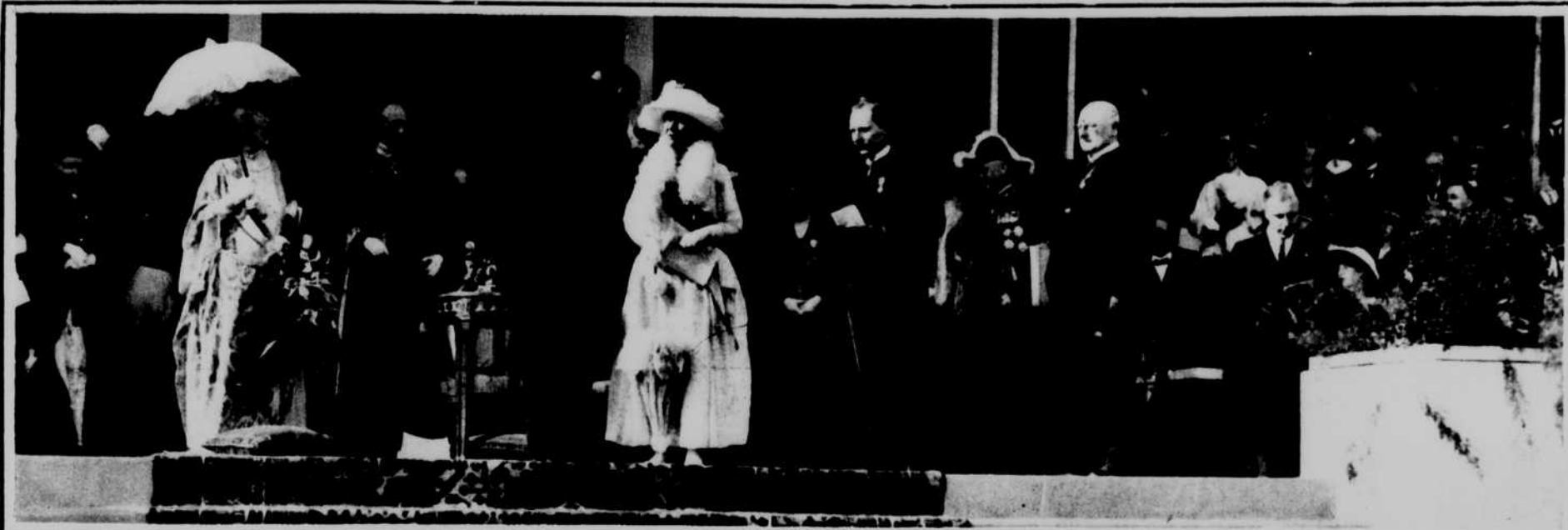
THE SILVER JUBILEE and the forty-third birthday of Queen Wilhelmina of Holland is observed with joyous ceremonies at the Hague. The Queen, dressed in white, is greeting a high official on the balcony of the Royal Palace. Her husband, Prince Henry, in an admiral's uniform, can be seen on the platform.