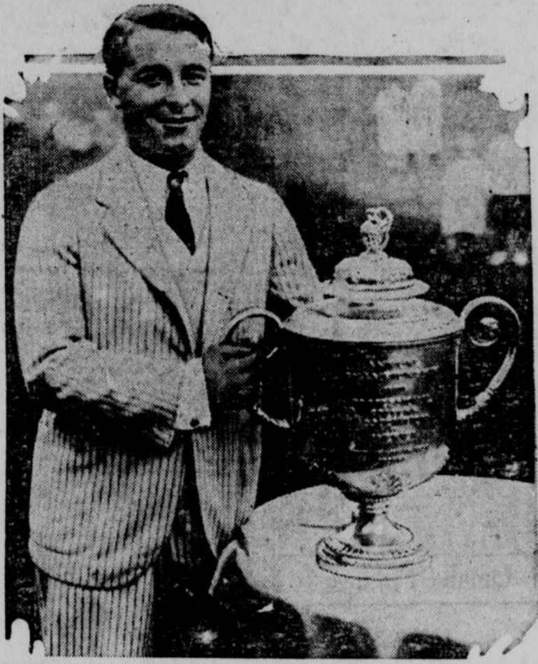
Gene Sarazen, etc.

Gene Sarazen defeated Walter Hagan on the 38th hole at Pelham, N. Y., in a recent tournament, to retain his title of Professional Golf Champion. In addition to winning the title Sarazen was given a check for $1,500 by the Briarcliff Lodge club, of which he is professional.