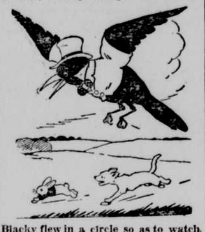
Blacky flew in a circle so as to watch.

hedge. He had hunted along it many times. He knew that there was only one small hole in it big enough for a Rabbit to get through. He guessed right away that Peter knew about that hole and was running for it. "He thinks that if he gets through that hole to the other side of that hedge he will be safe," thought the dog. "He knows I can't get through that hole, but I'll fool him. Yes, sir, I'll fool him. That is just what I'll do. He has forgotten that I can jump over that hedge. Once we are both on the other side I'll catch him, for there is no place for him to hide."