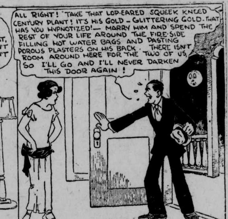
Sparky Evidently Has a Different Sense of Humor.

DECEITFUL ? YOU CAN'T TALK TO ME LIKE THAT, CHARLIE! IT ISN'T LIKE IT A BIT