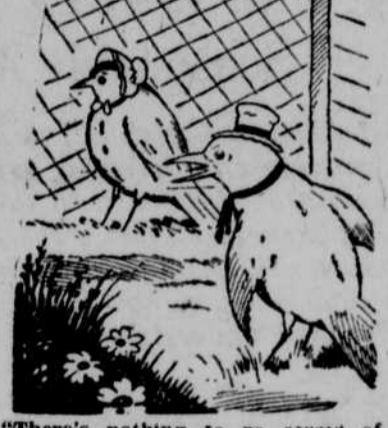
"There's nothing to be afraid of," said he to Kitty.

few times and set him free. Nothing more was done to him. No band was put on his other leg. He was just simply allowed to go. After that Brownie had no fear of that trap. He found it was the same way with Chippy the Chipping Sparrow. He happened to be around when the latter was caught for the third time. Chippy didn't seem to mind it at all. No sooner was the trap reset than Brownie walked into it. This time it didn't drop. He ate his fill and walked out again. The next day he was back there. Presently he was joined by Kitty the Catbird. It was the first time that Kitty had been in there. Down came the trap and both were caught. Kitty the Catbird was frightened almost to death. Brownie knew just how Kitty felt. Brownie calmly kept on eating. He wasn't excited at all. "There's nothing to be afraid of," said he to Kitty when the latter had become a little bit quiet. "No harm is going to come to you. Farmer Brown's boy is going to get you free. Here he comes now." At once Kitty the Catbird became