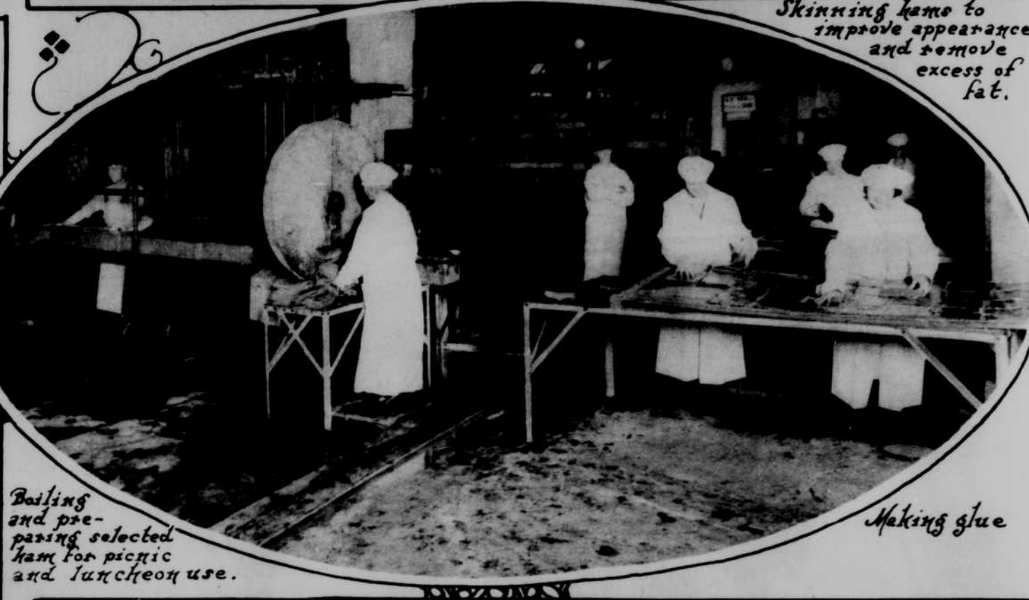
Boiling and pre-passing selected ham for picnic and luncheon use.