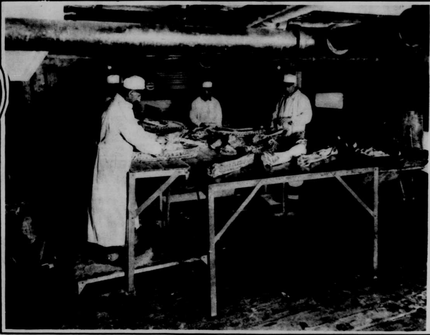
Trimming pork loins