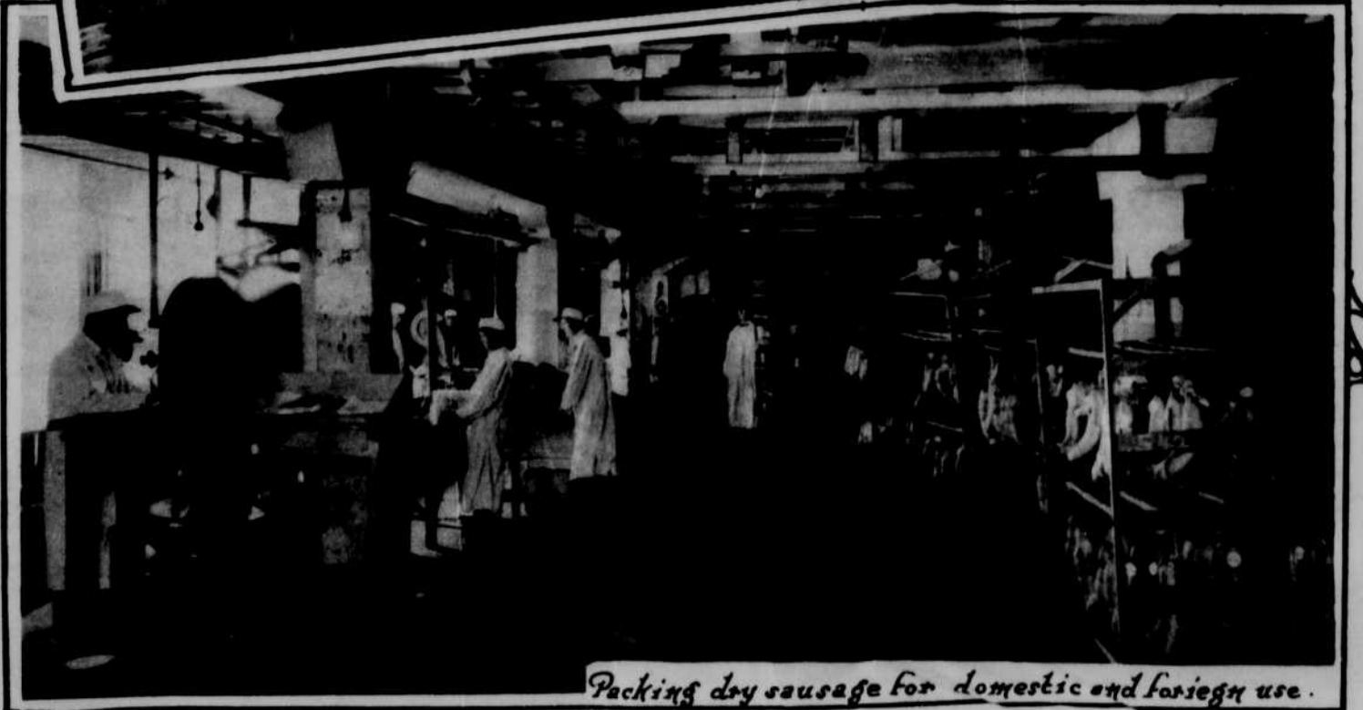
Packing dry sausage for domestic and foreign use.