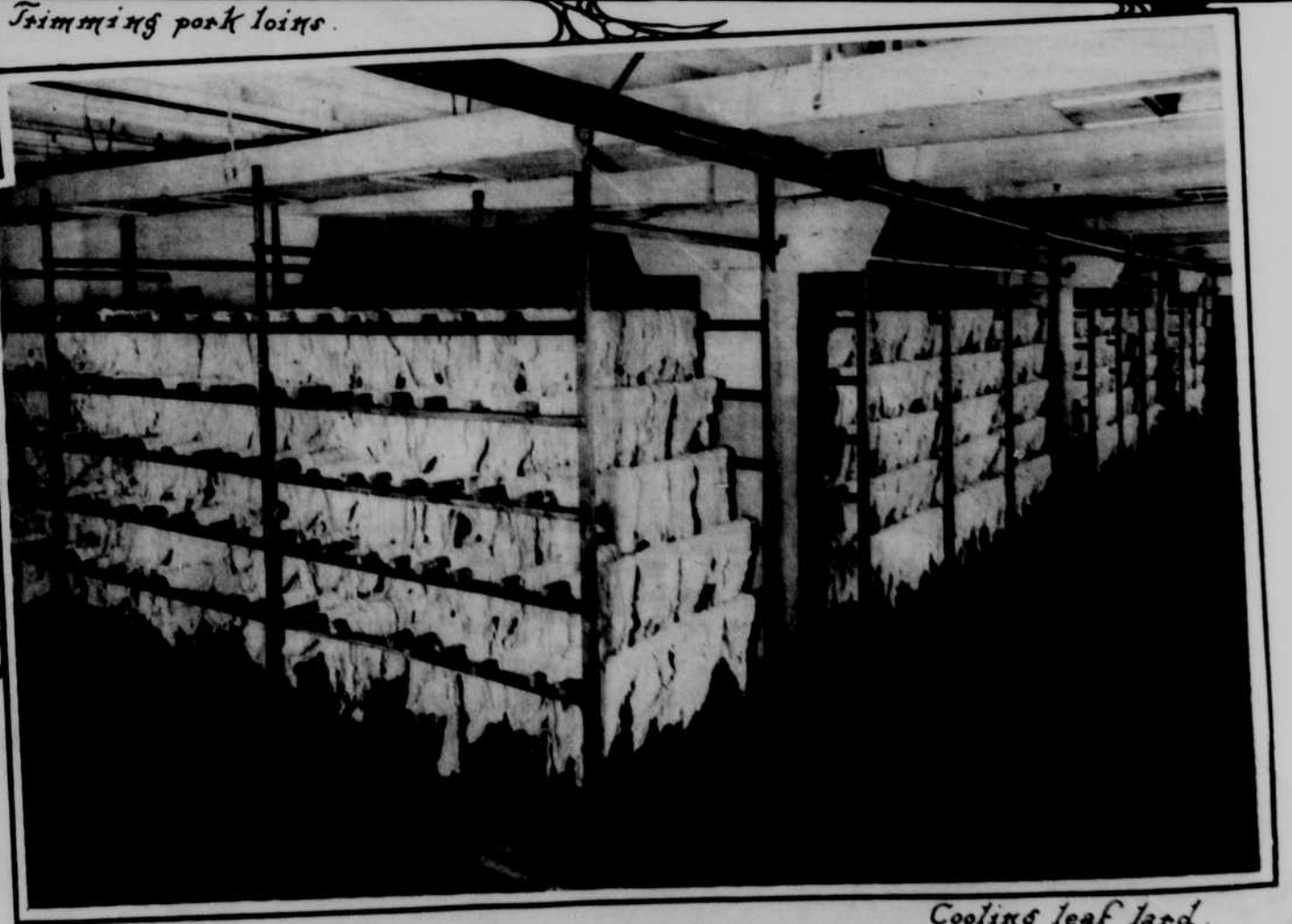
Cooling leaf lard