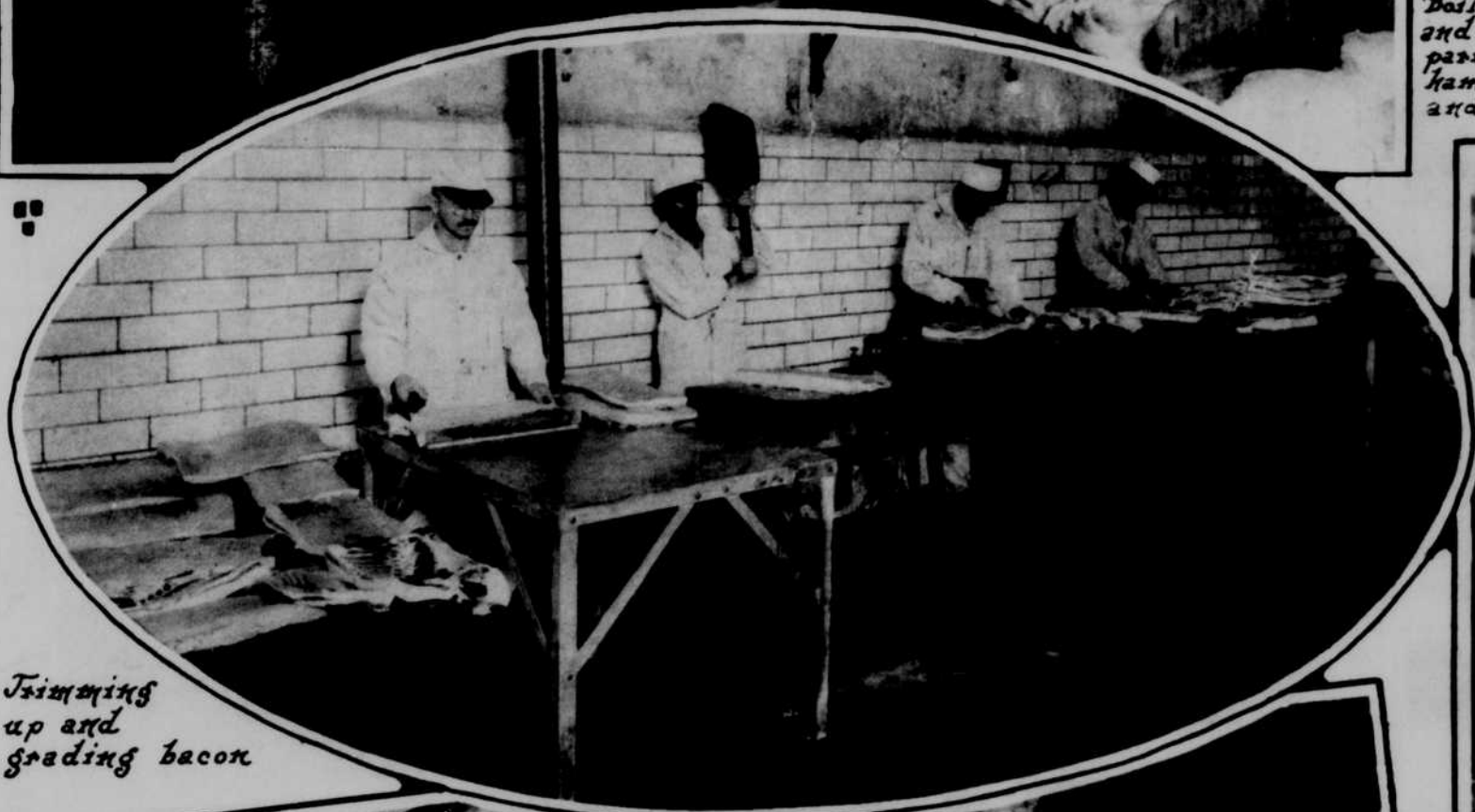
Trimming up and grading bacon