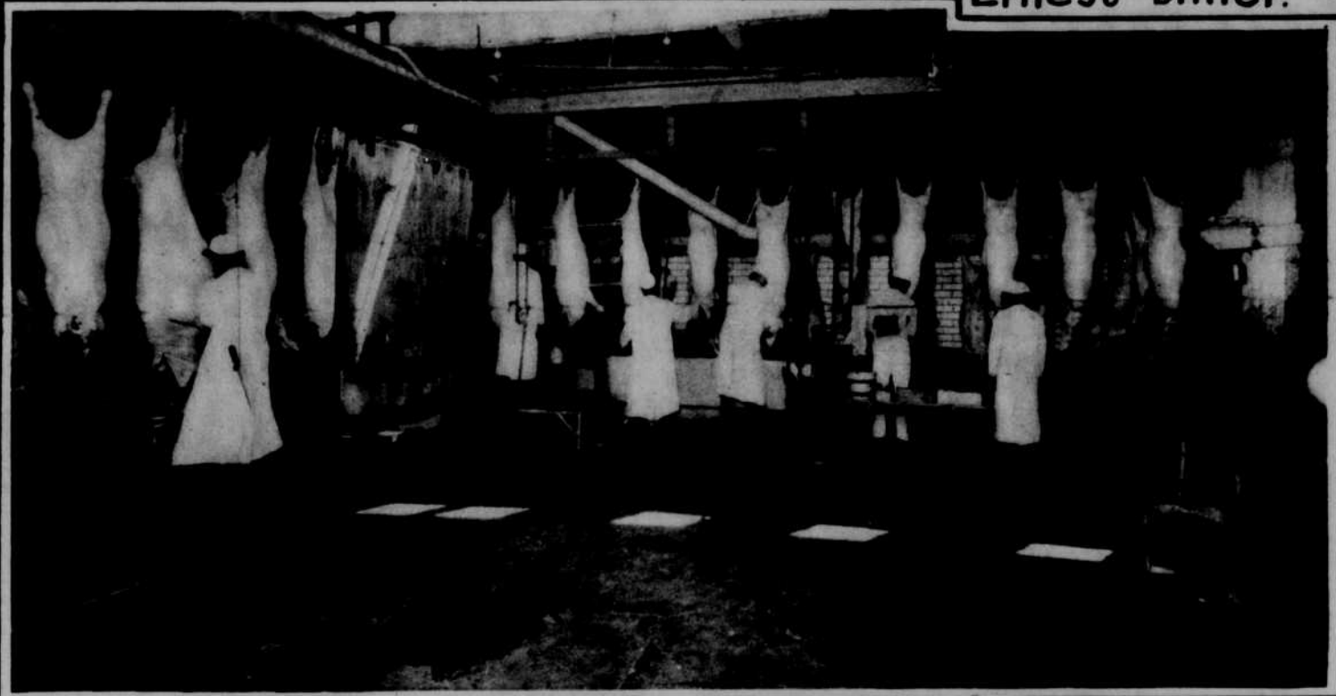
Government inspectors examining newly killed hogs

A photographic study of the Omaha packing houses by Ernest Bihler.