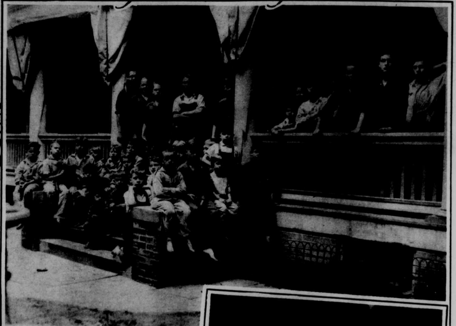
Here are the youngsters who live in the Masonic Home for Boys, as bright and intelligent a group as you will find anywhere.