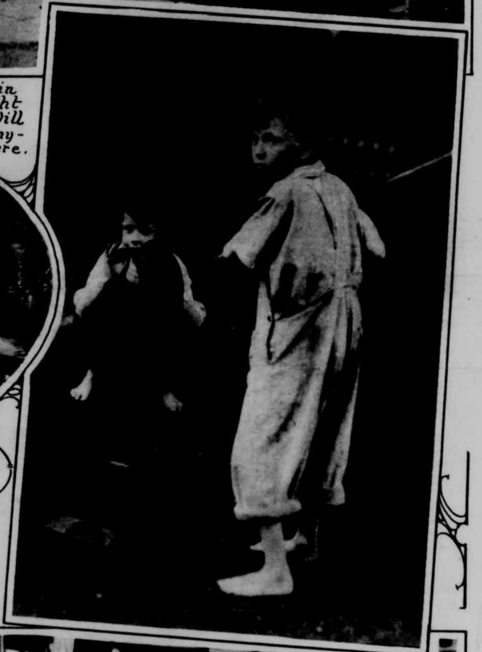
Better give this lad four wide ones. He has red hair.