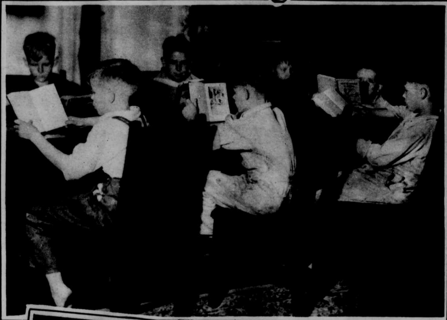
The library is equipped with hundreds of books.