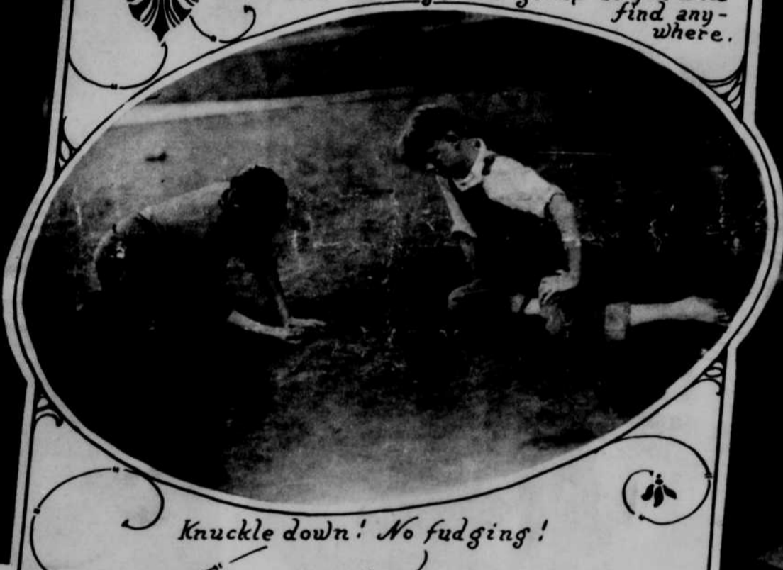
Knuckle down! No fudging!