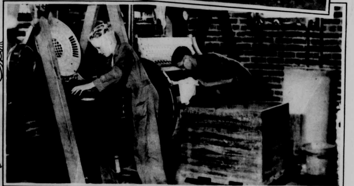
The boys operate their own laundry