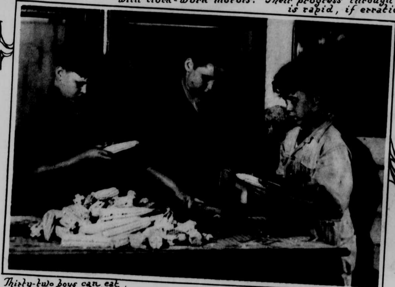
Thirty-two boys can eat a powerful lot of roasting ears.