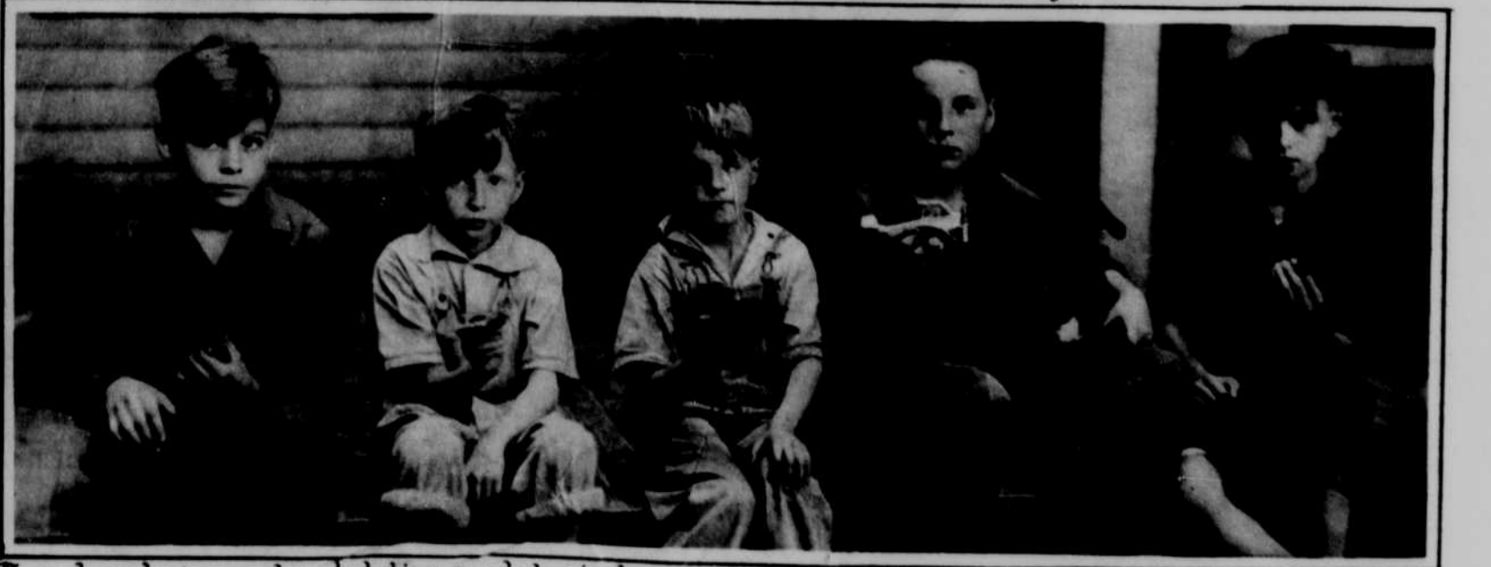
These boys have constructed tiny model airplanes. The propellers are pitched so as to revolve with the wind, and the models are painted with gay water colors.