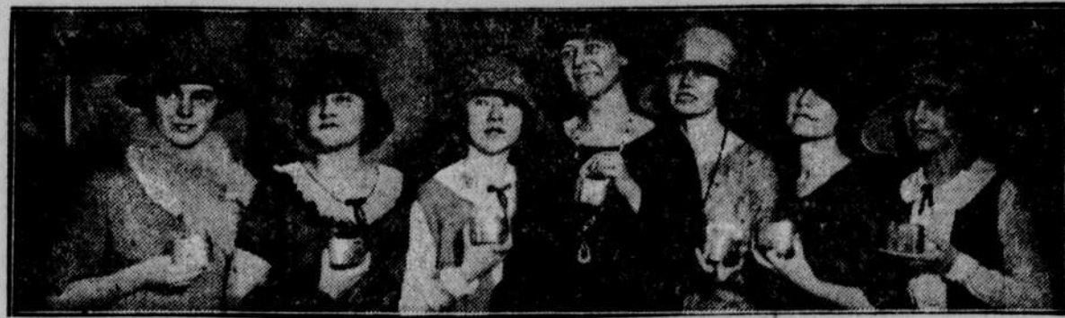
Here's the bandit brigade of the University of Omaha.

All the girls in the picture, armed with nickel-plated savings banks and a disarming smile, are members of the public school music class at the university, and have pledged themselves to raise $300 toward a fund for the purpose of buying records and music.