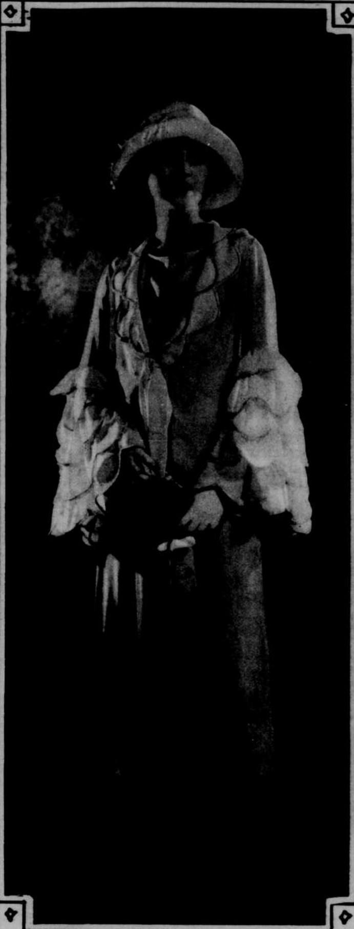
Mary Astor as she appears in "The Marriage Maker".