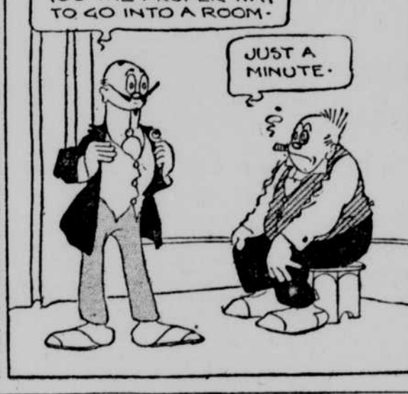
TAKING IT FOR GRANTED. MIGOSH = YOU DIDN'T COUNT THAT 200 BUCKS