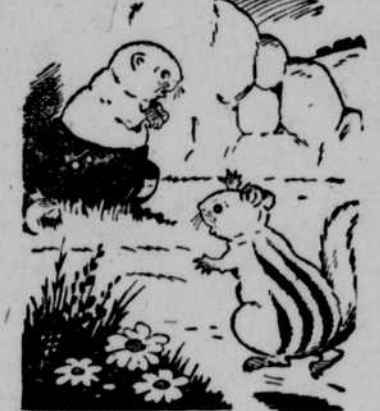
"They say that Shadow the Weasel has been seen on the old stone wall," cried Striped Chipmunk

A rumor is a story that no one knows positively is so, and the start of which no one seems to know. There are good rumors and bad rumors, and somehow they travel astonishingly fast. It was a rumor that caused the young Chuck, who for some time had been living in the old stone wall on the edge of the Old Orchard, to make up his mind that it