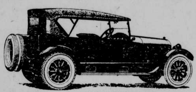
TYPE of PHAETON $2895 at Detroit

Drive The Big New Overland Fab Toledo RED BIRD $750 'THE HIT OF THE YEAR'