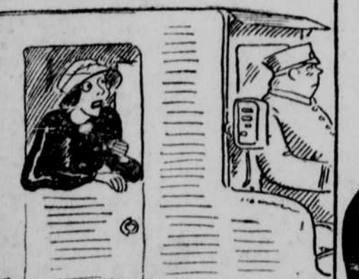
AND THERE IS AN ACCIDENT ON THE WAY DOWN AND YOUR TAXI GETS CAUGHT IN THE TRAFFIC JAM