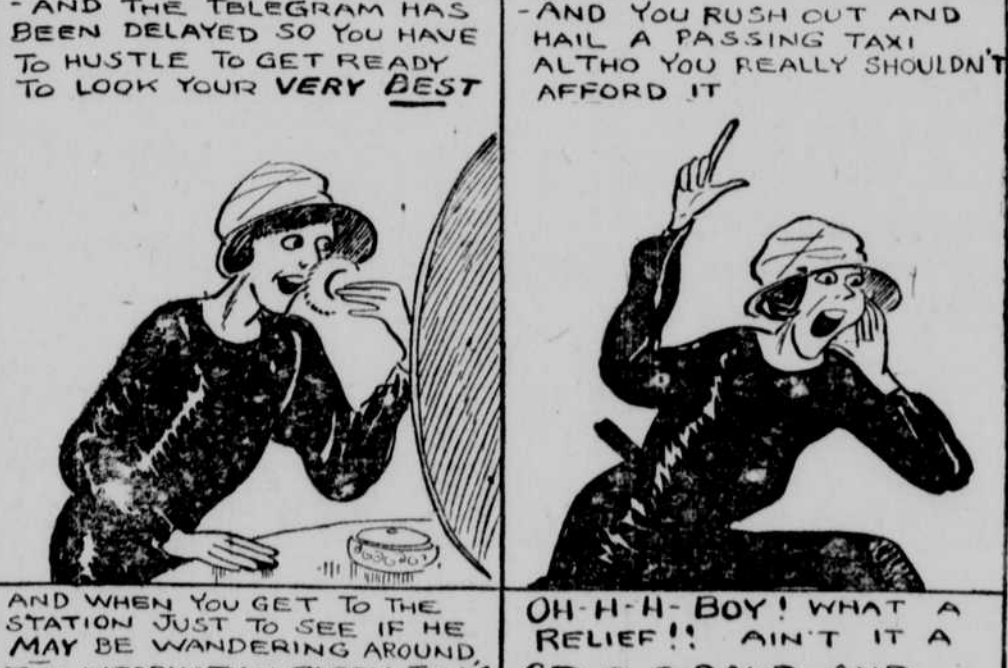
OH-H-H-BOY! WHAT A GR-R-R-RAND AND GLOR R- R-RIOUS FEELIN'S