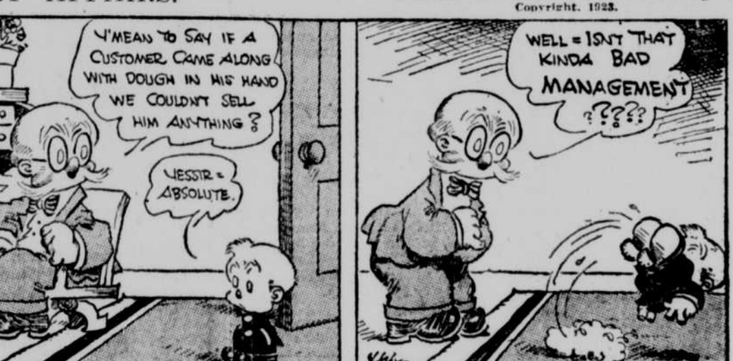
By Briggs ABIE THE AGENT ___ Drawn for The Omaha Bee by Hershfield