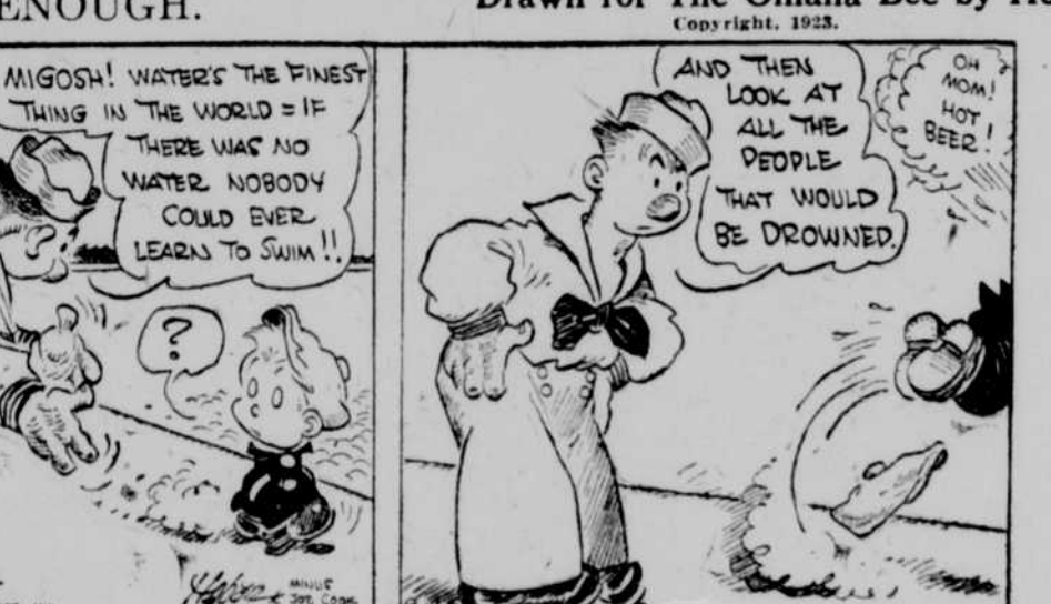
Drawn for The Omaha Bee by Hoban