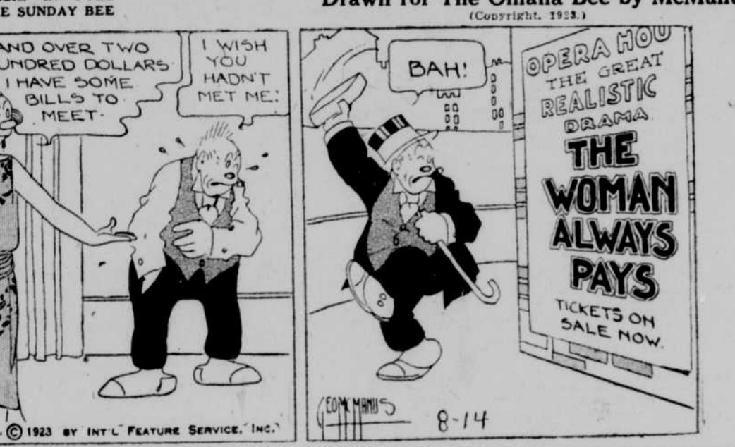
Drawn for The Omaha Bee by McManus