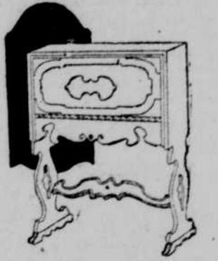
Very Fine Renaissance Desk

Built in genuine Mahogany, finished in two tones, this desk is an exceedingly good looking piece. The front panel lets down, disclosing the bed of desk, pigeon holes and drawers.