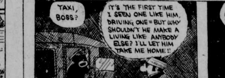
BEE WANT ADS BRING RESULTS By Briggs ABIE THE AGENT .- Drawn for The Omaha Bee by Hershfield