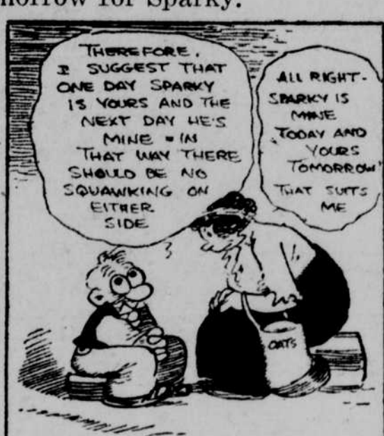
Drawn for The Omaha Bee by Billy DeBeck