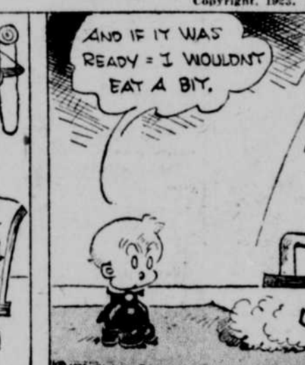
ABIE THE AGENT