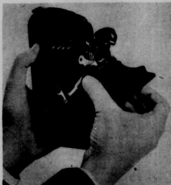
2 Springs into action with a snap .