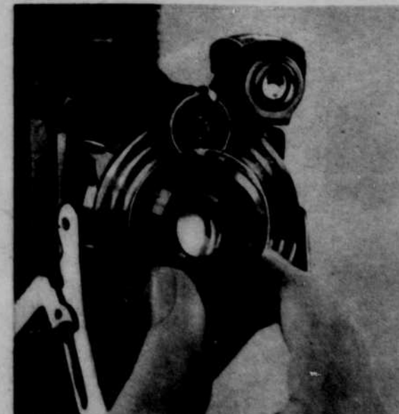
3 Focused for sharp pictures with a turn .

Eastman Kodak Company, Rochester, N. Y. The Kodak City