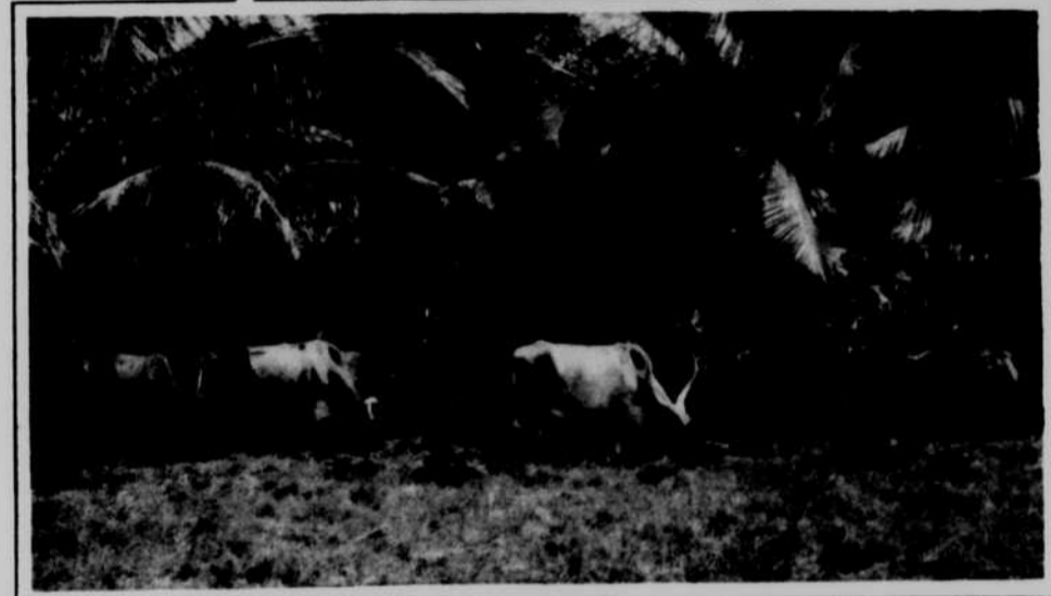
Hindoo cattle are the beasts of burden. The skins of these cattle give off a peculiar perfume, that is very offensive to mosquitoes and bugs and these animals prosper where other cattle die