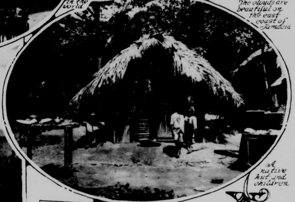
A native hut and children