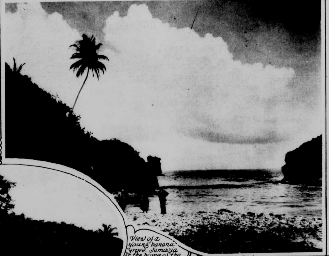
View of a young banana grove. Jamaica is the home of the finest banana in the world