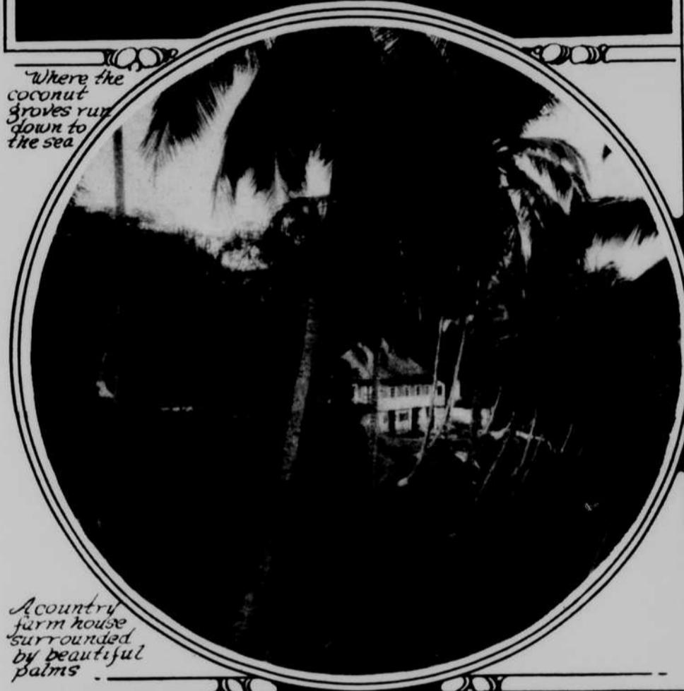
A country farm house surrounded by beautiful palms