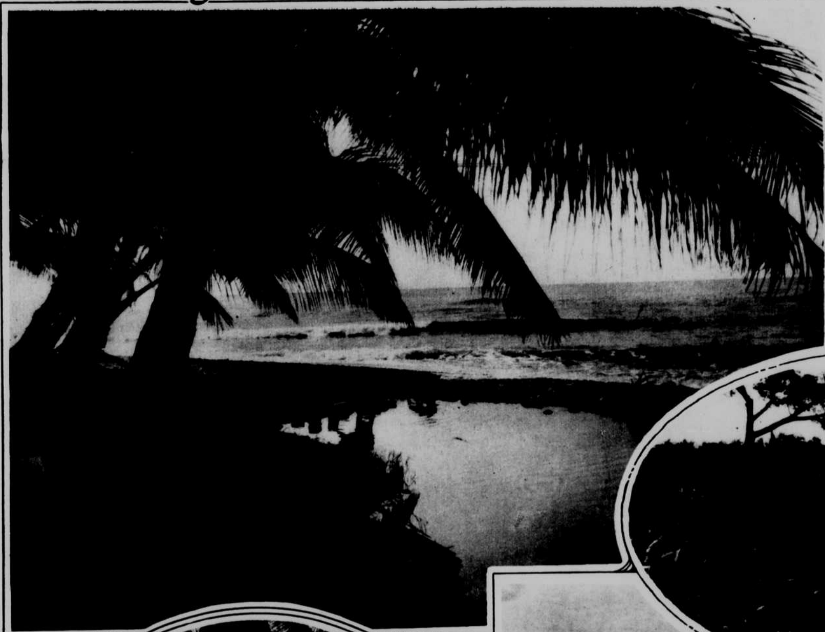
Where the coconut groves run down to the sea

Another page of pictures taken by Louis R. Bostwick on a cruise of the Caribbean Sea