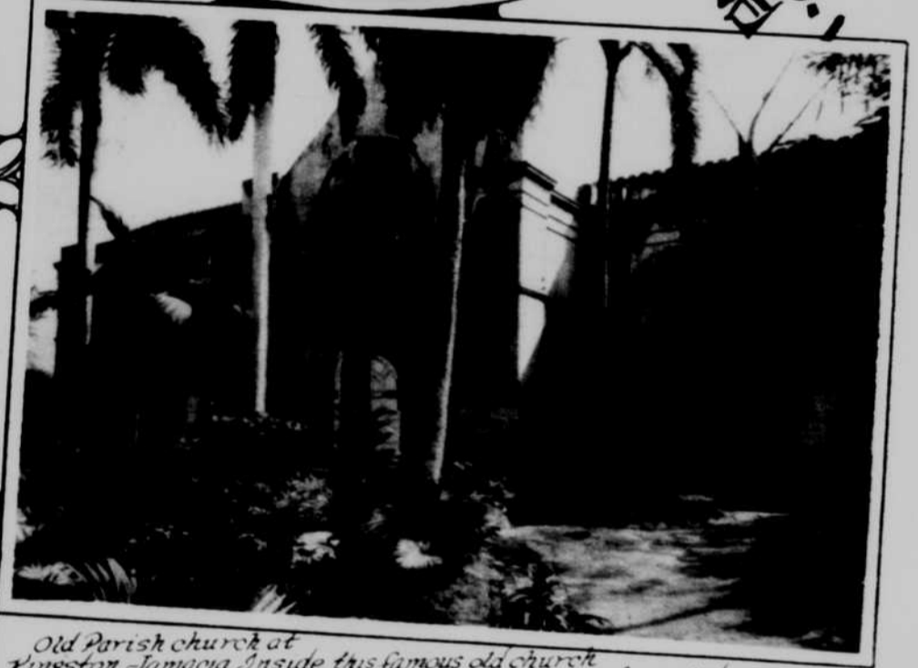
Old Parish church at Kingston Jamaica. Inside this famous old church is the grave of the heroic Admiral John Benbow, who saved Jamaica for his queen. One of the most disgraceful episodes in the history of the British navy