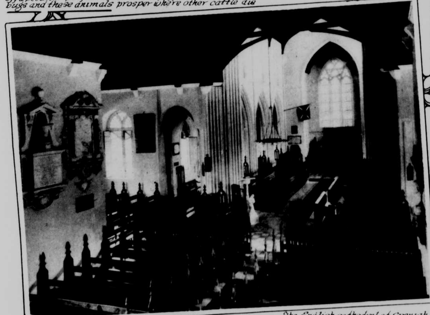
The English cathedral at Spanish town - this venerable church is the Westminster Abbey of Jamaica. Here are buried the makers of Jamaica, martyrs, governors, sea captains, judges and their consorts. Many of the monuments are exquisite